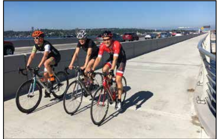
Cyclists on the SR 520 Trail take advantage of sunny weather with a ride over Lake Washington.