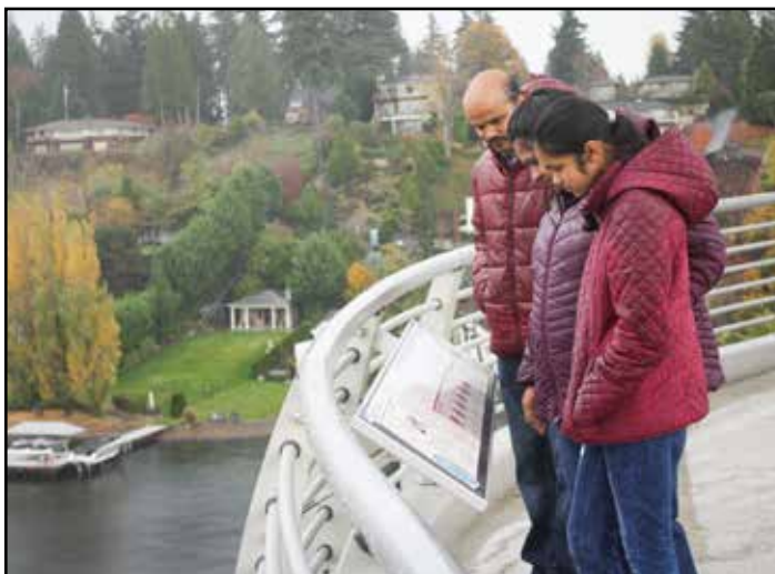
A family reads an informational sign about the construction of the SR 520 floating bridge at one of the lookouts over Lake Washington on the SR 520 Trail.

Bicyclists may notice steel-plate covers over the floating bridge expansion joints as they travel on the path. These plates are necessary for the safety of path users and the structural integrity of the bridge. Trail goers will see a sign at the head of the path and yellow paint alerting them of the plates.