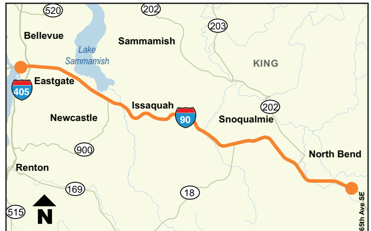
The study covers 26 miles of I-90 from Bellevue to North Bend

WSDOT and the Federal Highway Administration (FHWA) co-manage the interstate system in Washington State. Any changes to the interstate system, including I-90, require FHWA's approval. FHWA approved construction of the I-90 Sunset interchange in Issaquah with the requirement that WSDOT fund and conduct a corridor study that addresses the safety and mobility needs of this fast-growing corridor. To meet this requirement, the 2005 Washington State legislature funded $2 million for a study of I-90 between Eastgate in Bellevue and 465th Ave. S.E. in North Bend so that we can identify short- and long-term projects for this corridor to address safety and mobility needs.