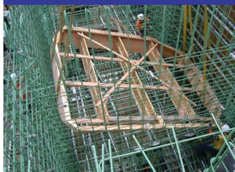
Setting interior wood forms needed for first concrete pour in pontoon PA.

Pontoon construction requires tracking hundreds of different materials and tasks. Learn how the Hood Canal Bridge Team keeps track of everything, from web graphics to pontoon form specifications.