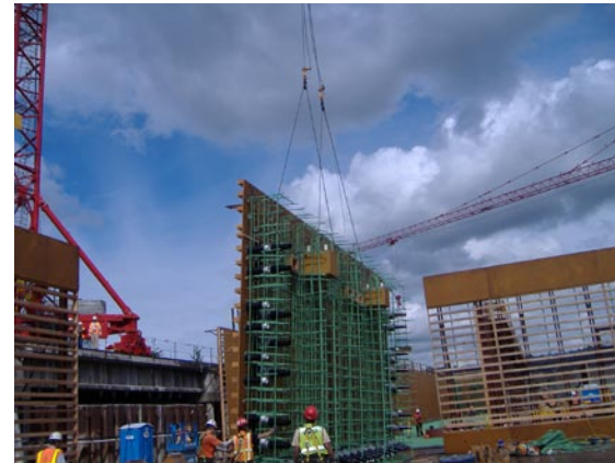
Tower crane operator lowers rebar mat into place.