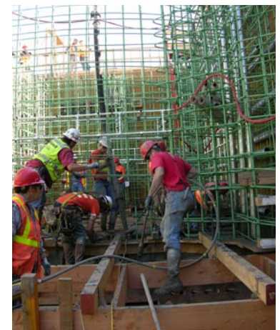
Workers spread concrete throughout the pontoon cell and work it down between rebar and conduit.

These first cycle pontoons are scheduled for completion by February 2007.