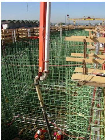
Crews work in tight spaces to pour concrete for pontoon PA floor.

The lessons learned throughout the pontoon PA concrete pouring process will be applied to the concrete pours for the remaining 13 pontoons.