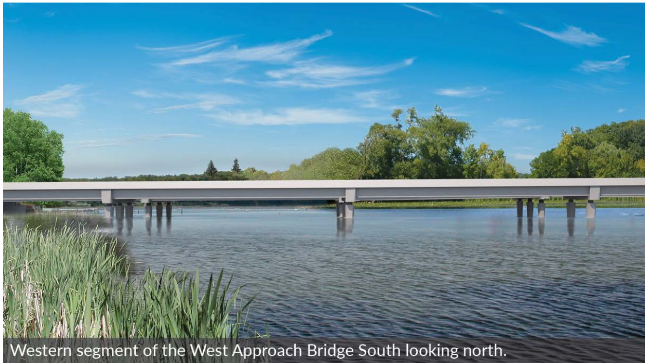
Western segment of the West Approach Bridge South looking north.