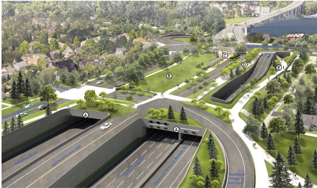
Figure 2 Final configuration looking west. For reference: A – West Portal; B – Neighborhood Open Space; C – South Montlake Plaza; D – North Montlake Plaza; E – SR 520 Trail