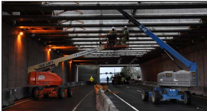
The Evergreen Point Road Lid under construction, from an aerial view looking north (top) and under the lid (bottom)