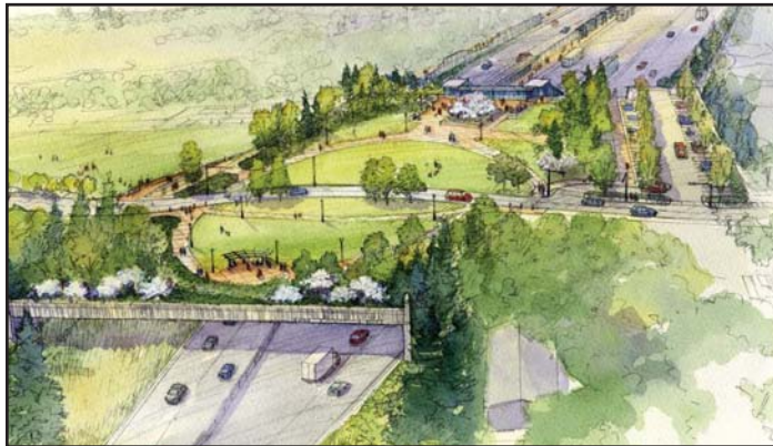
An artist's rendering of the new Evergreen Point Road lid, looking east. When complete, the lid will provide new open space, improve transit operations, provide better bicycle and pedestrian connections.

Project construction began in spring 2011, and is expected to wrap up in late 2013.