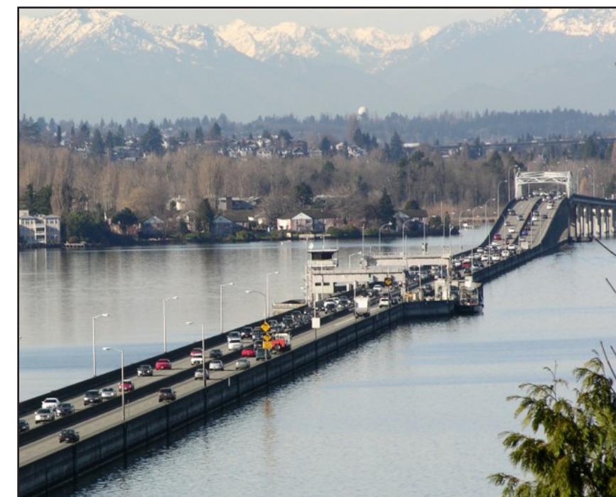
Traffic on the existing SR 520 floating bridge

Sustainability in transportation requires not only a well-designed, safe and accessible transportation system, but also the integration of multimodal transportation options, like transit and cycling, and a system that can be maintained and operated efficiently.