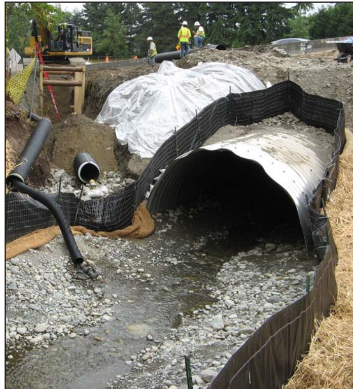
New and wider culverts will provide better fish passage on the Eastside.