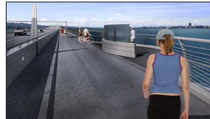
Rendering of the new bicycle/pedestrian path on the floating bridge that will connect bicyclists and pedestrians to regional trails on both sides of Lake Washington.