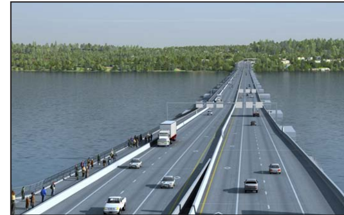
Rendering of the new SR 520 floating bridge.

We will build a new, safer SR 520 floating bridge that is more resistant to windstorms and will provide improved travel operations with new transit/HOV lanes and a bicycle/pedestrian path on the north side of the bridge. Project construction began in late 2011, and we have a target date to open the new floating bridge in 2014.