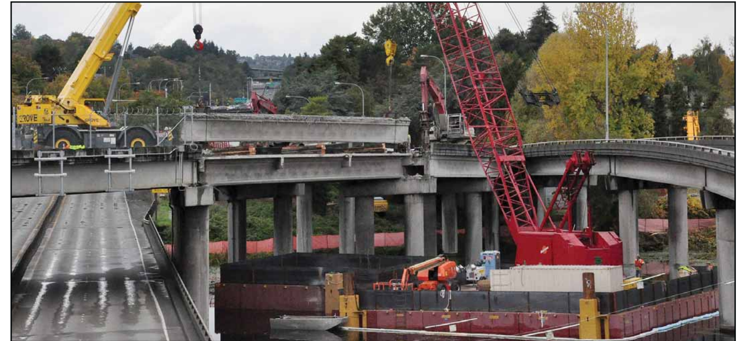
During the Oct. 17 – 20 weekend closure, crews used cranes to remove the first girder of the R.H. Thomson "Ramps to Nowhere". Photo taken Oct. 18, 2014.