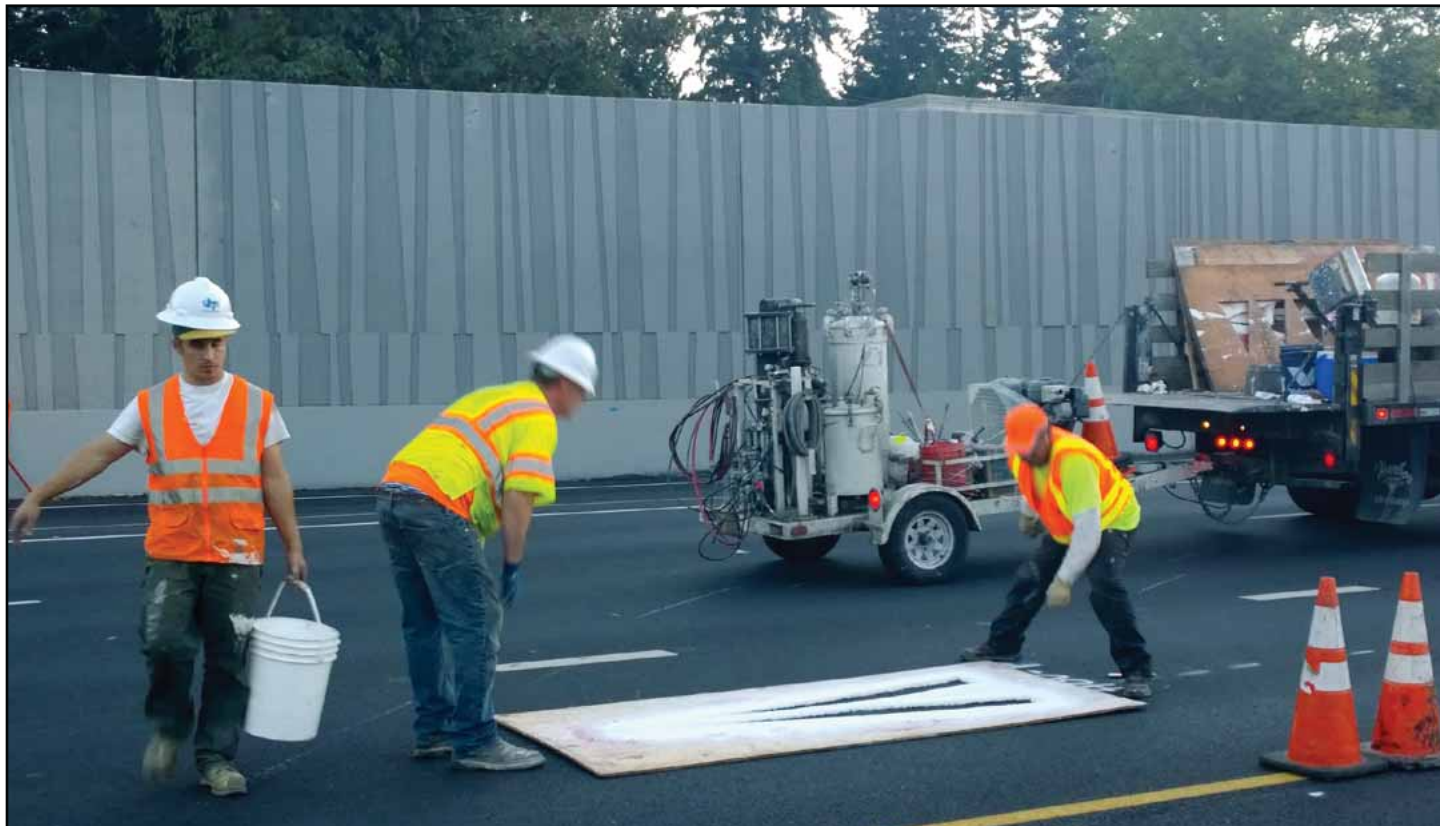
During the Oct. 17 – 20 weekend closure, crews on the Eastside painted HOV lane symbols and other roadway markings. Photo taken Oct. 19, 2014.