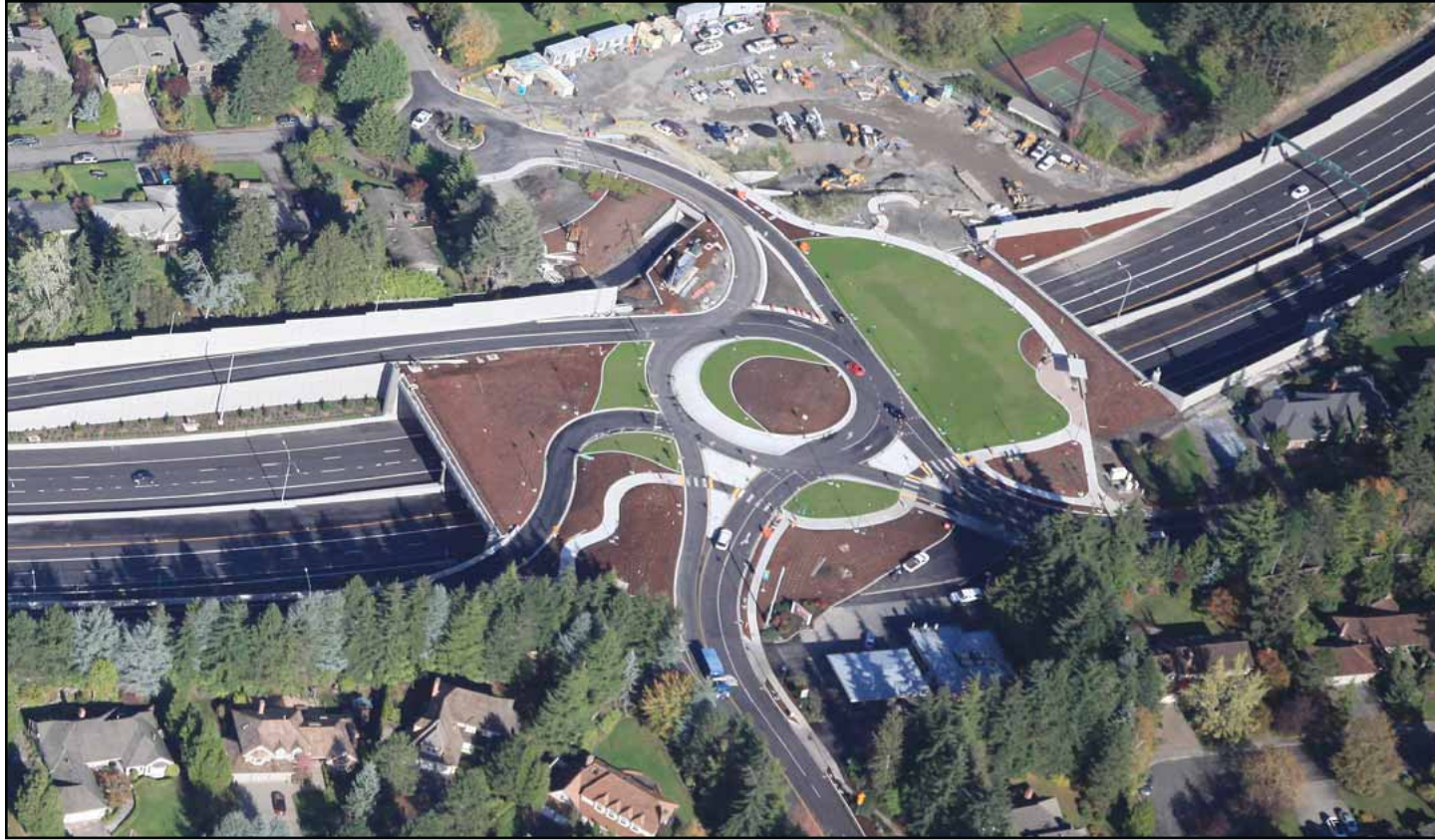
Crews installed landscaping on the new 84th Avenue Northeast lid on the Eastside during the month of October. Photo taken Oct. 29, 2014.