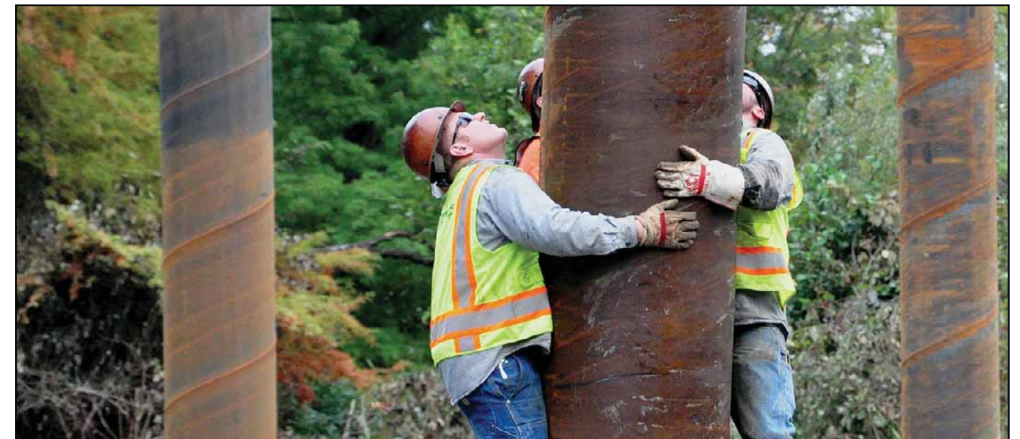
During the Oct. 17 – 20 weekend closure, workers installed piles on Foster Island for a work bridge to be used during construction of the new West Approach Bridge North. Photo taken Oct. 18, 2014.