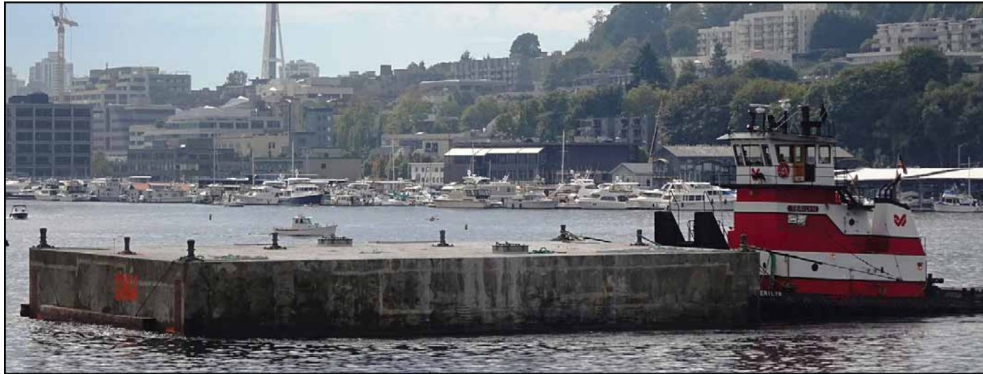
Pontoon GNW was one of nine pontoons to arrive in Seattle during the month of October. Photo taken Oct. 4, 2014.

Americans with Disabilities Act (ADA) information: This material can be made available in an alternate format by emailing the WSDOT Diversity/ADA Affairs team at wsdotada@wsdot.wa.gov or by calling toll free, 855-362-4ADA(4232). Persons who are deaf or hard of hearing may make a request by calling the Washington State Relay at 711.