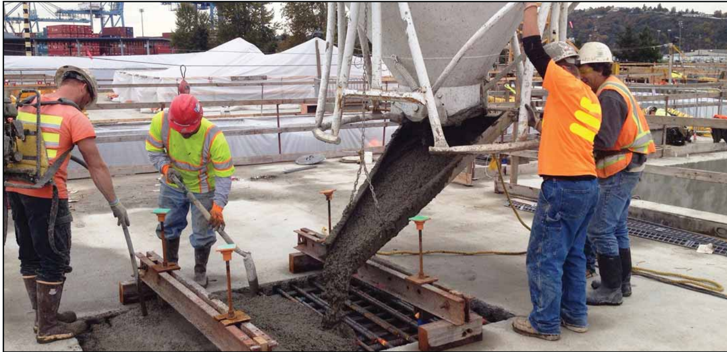
Crews in Tacoma pour concrete to complete soffit installation on one of eight supplemental stability pontoons currently under construction. This is the sixth and final cycle of pontoon construction in Tacoma. Photo taken Oct. 24, 2014.