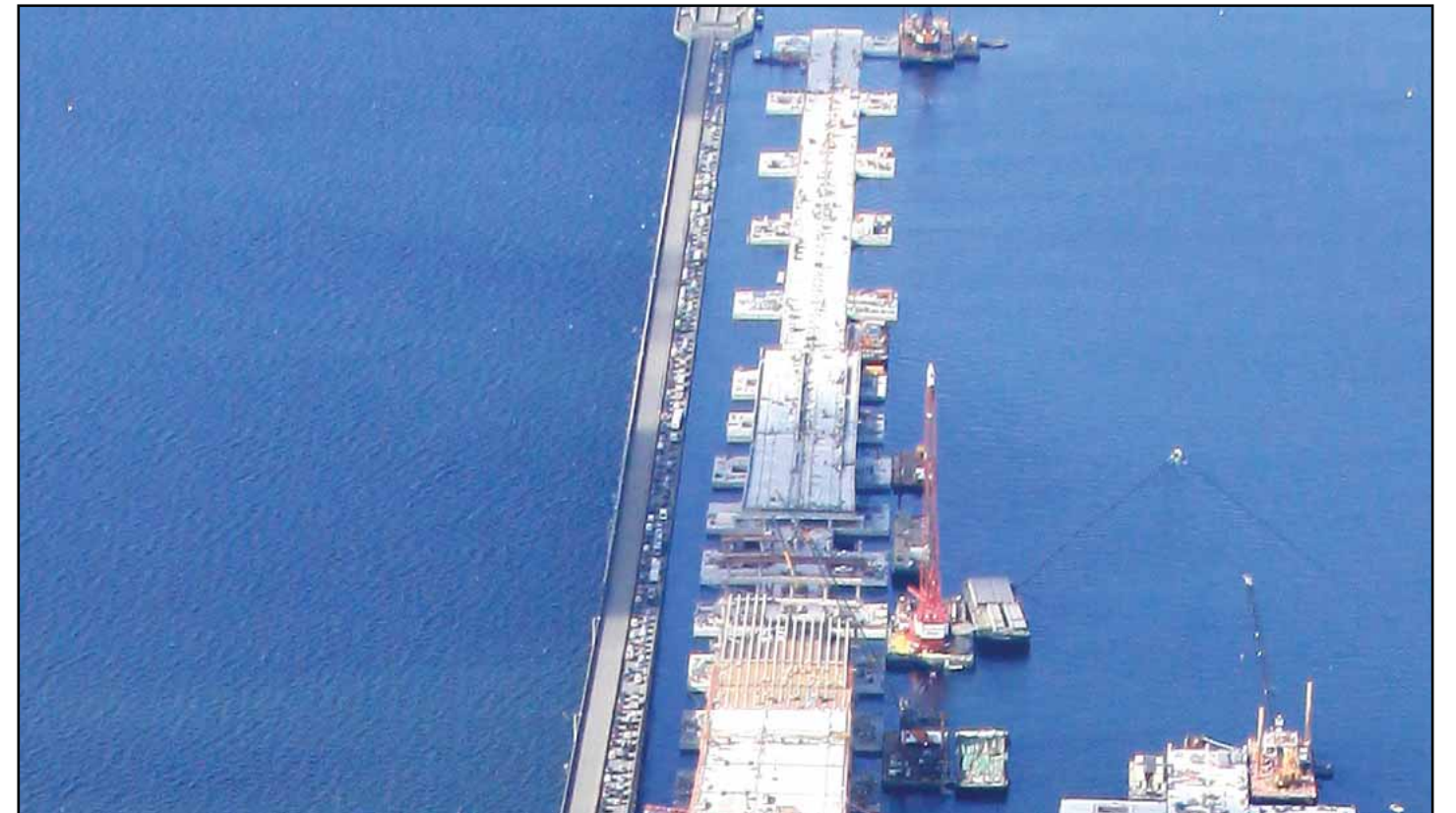
The new floating bridge takes shape as crews on Lake Washington joined longitudinal pontoons and installed over 35 new low-rise roadway deck sections. Photo taken Oct. 29, 2014.