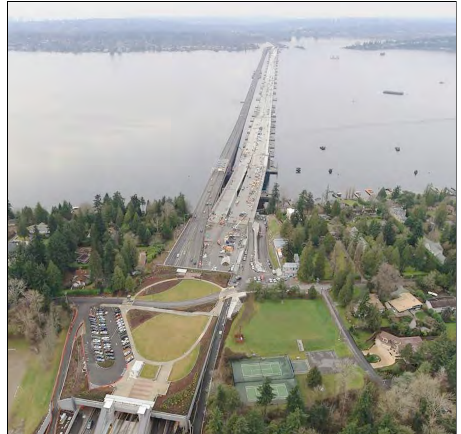
Aerial view of SR 520 Floating Bridge and Landings at Medina, facing west. Photo taken: Jan. 7