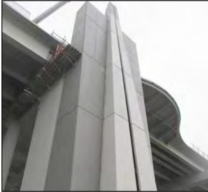
Crews complete one of the four sentinels on the new floating bridge Photo taken: Jan. 5