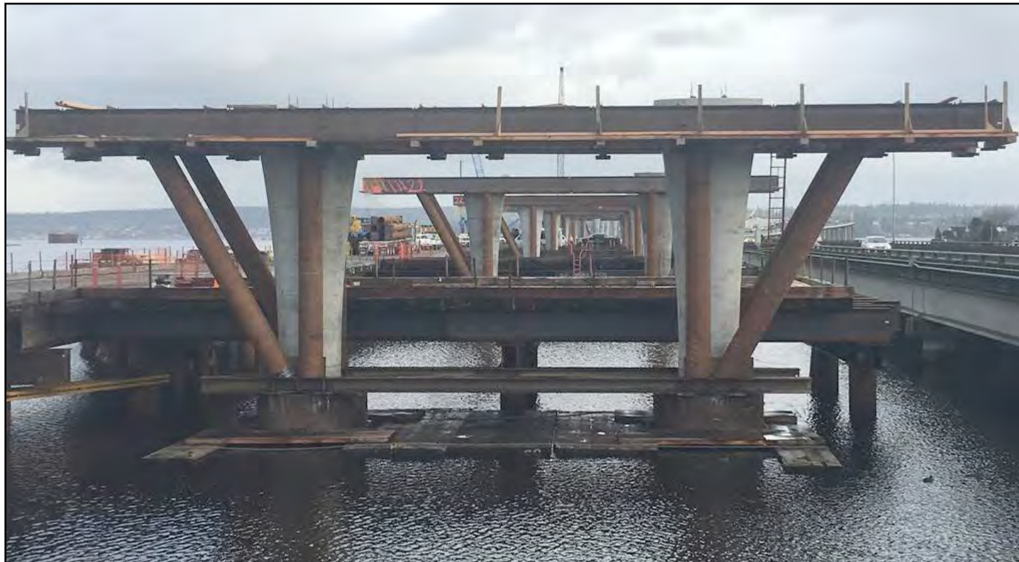
Crews install falsework to support girders while the roadway concrete is poured. Photo taken: Jan. 28