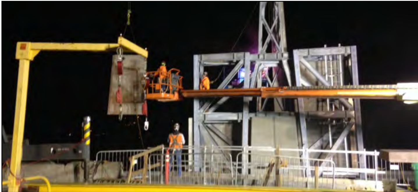
Crews continued to build the Pontoon A north sentinel throughout January. Photo taken: Jan. 18

Americans with Disabilities Act (ADA) information: This material can be made available in an alternate format by emailing the WSDOT Diversity/ADA Affairs team at wsdotada@wsdot.wa.gov or by calling toll free, 855-362-4ADA(4232). Persons who are deaf or hard of hearing may make a request by calling the Washington State Relay at 711.