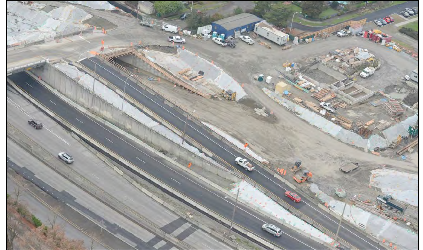
Aerial view of new westbound SR 520 off-ramp to 24th Avenue East, opened to traffic on Wednesday, Jan. 6. Photo taken: Jan. 7