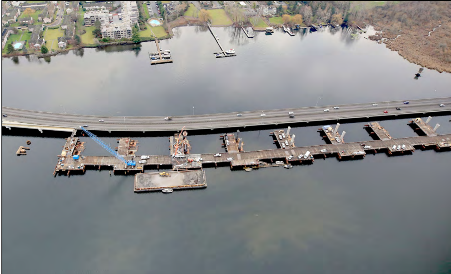
Crews continue to make progress on the WABN project, pouring columns east of Foster Island. By the end of January, crews had poured 28 columns for the permanent WABN structure. Photo taken: Jan. 20