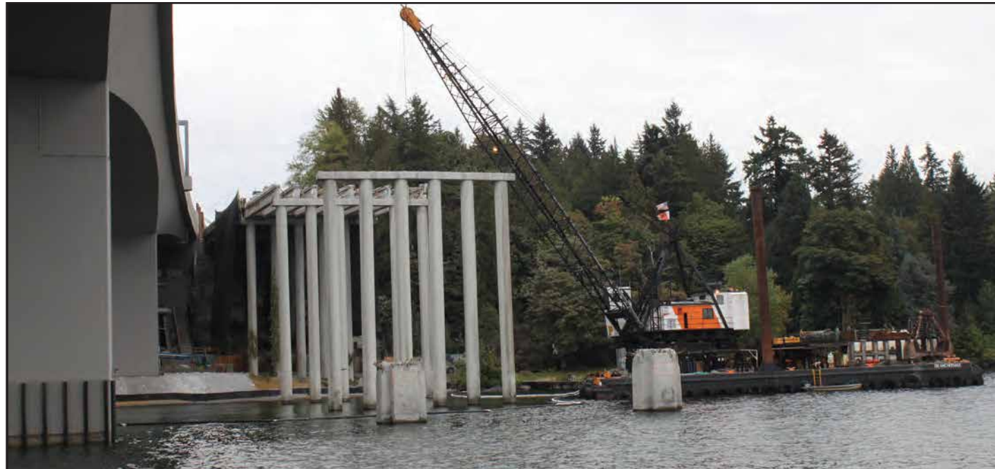
Crews work to complete the removal of the old floating bridge's east landing along the Medina shore of Lake Washington. Photo taken: Sept. 16