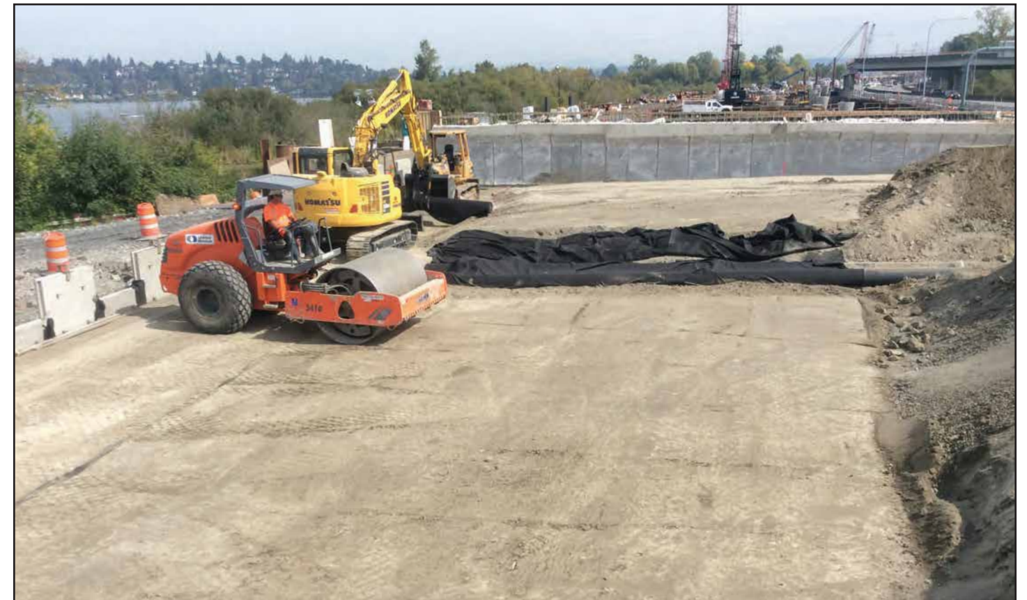
Crews in the MOHAI staging area compact soil in preparation for SR 520's landside connection to the new West Approach Bridge North. Photo taken: Sept. 22