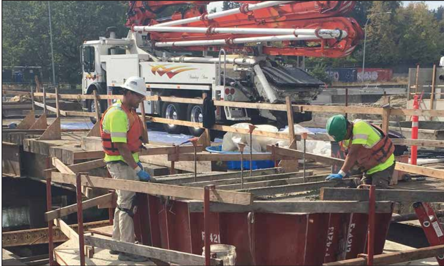
Crews building the West Approach Bridge North pour concrete for the last of 95 columns that will support the new bridge deck. Photo taken: Sept. 16