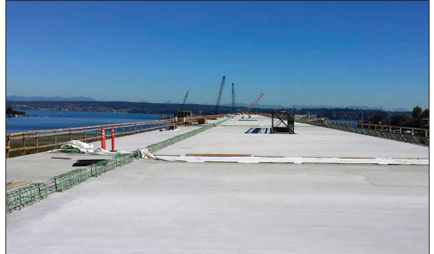
The West Approach Bridge North's concrete deck is in place at pier 19. The new SR 520 regional shared-use path, at left, will extend from the Eastside to local trails in Seattle. Photo taken: Sept. 30