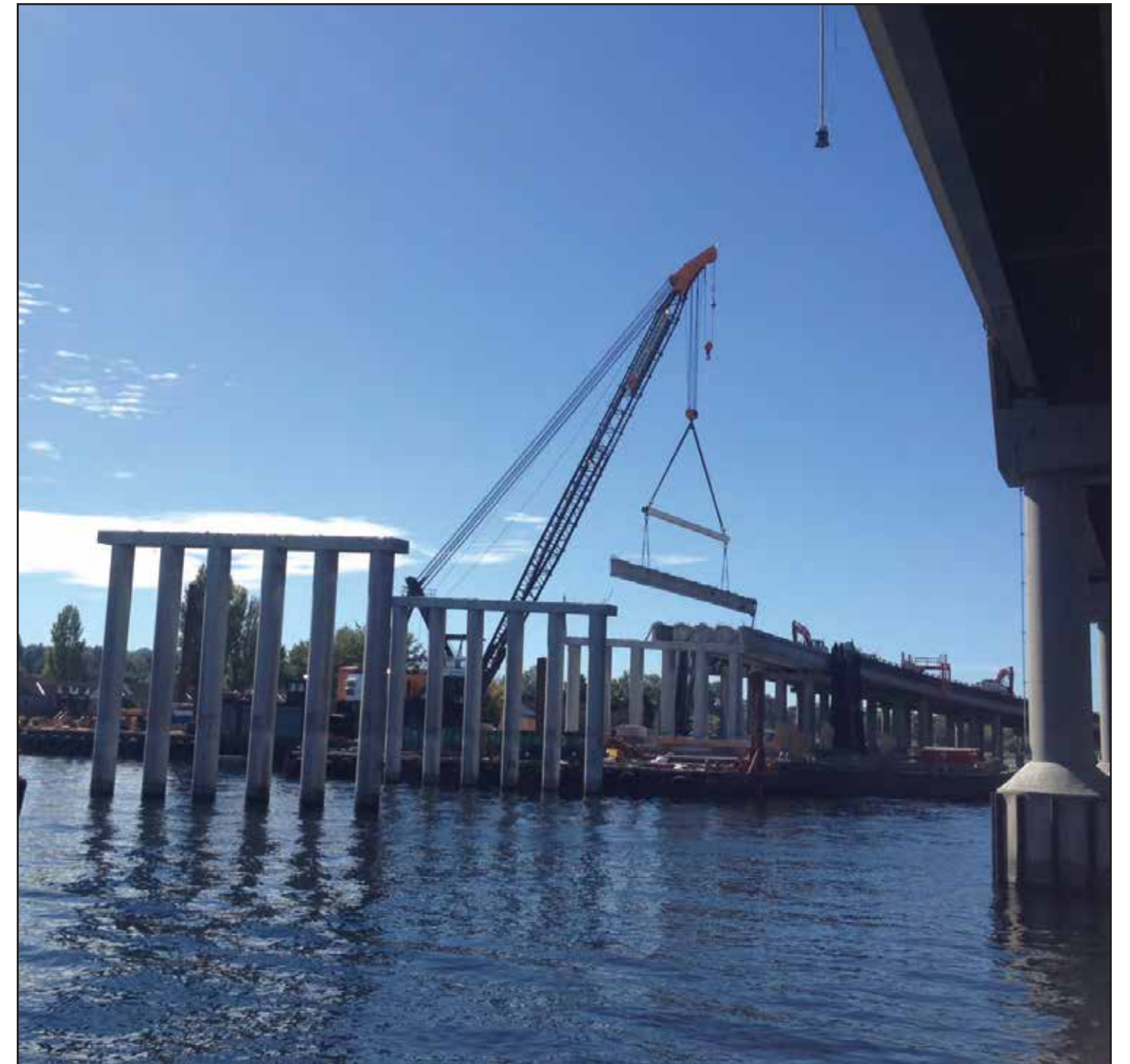
Crews on Lake Washington continue removing girders and columns from the eastern segment of the old west approach bridge. Photo taken: Sept. 9