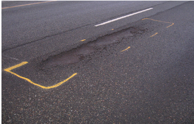
Exhibit 3-4 Potholes

Pothole repairs will generally be full-depth patches, but care should be taken to confirm that they are full-depth. The repair area will always need to extend beyond the limit of the visible distress to get to sound material. If repairs only include the affected area, reoccurring distresses typically result.