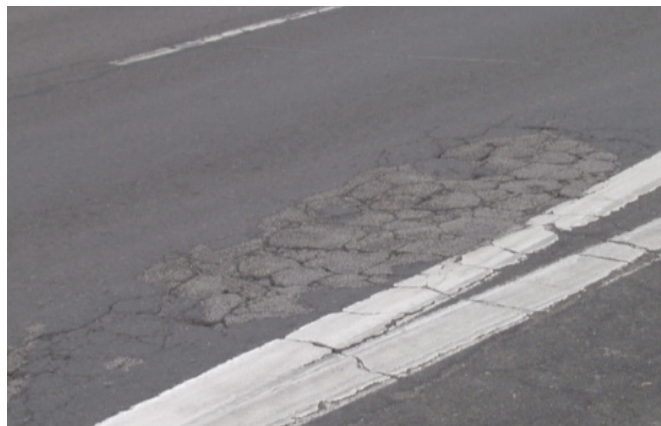
Exhibit 3-3 Alligator Cracking

If the alligator cracking isn't extensive, subgrade material isn't visible and signs of depressed pavement isn't present, a chip seal might be a possibility. The typical repair method, however; is to complete a partial-depth or full-depth patch. Full-depth cracking extends through the entire pavement structure, whereas partial-depth cracking goes through a portion of the pavement.