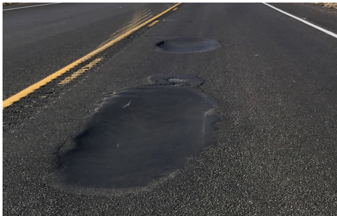
Exhibit 3-8 Sags and Humps

This distress typically results in full-depth repairs although a partial-depth patch or a micro-grind may be used depending on the cause of the distress.