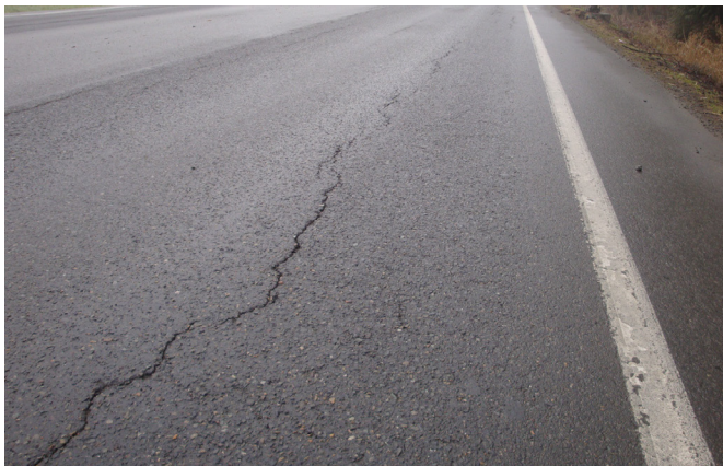
Exhibit 3-1 Longitudinal Cracking

This type of crack is usually a non-working crack that can be treated with a crack sealing material. It is highly recommended that these cracks are filled before getting to a width greater than a \frac{1}{2} inch to reduce sealant cost. Although this is the most cost-effective treatment option available, attempting to seal cracks that are greater than \frac{3}{4} inch is challenging and a mastic material may be used if the cracks are larger than 1 inch.