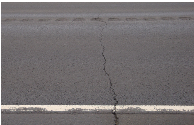
Exhibit 3-2 Transverse Cracking

Transverse cracks are most typically a working crack and sealing these cracks with a rubberized material is the most effective treatment option, although crack sealing with mastic material is an alternative if cracks are greater than 1 inch.