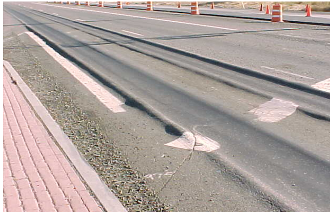
Exhibit 3-7 Rutting

There are a few options available to address this type of roadway distress. Rut filling with HMA is the most widely used, however; a second rut filling option is to utilize chip seal materials. Grinding of rutting can also occur but care must be taken to ensure this option will remove ruts until preservation occurs.