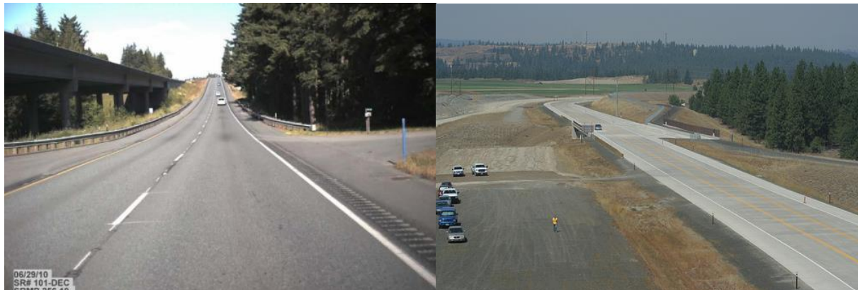
Exhibit 720-1 Phased Development of Multilane Divided Highways

When there is a median gap between bridges of 6 inches or more, the Region PEO will evaluate whether or not the median gap needs to be screened. Address the potential for pedestrians on the bridge and if closing the median gap to less than 6 inches, or installing fencing, netting, or other elements to enclose the area between the bridges would be beneficial. Document this evaluation in the Basis of Design and Alternatives Comparison Table.