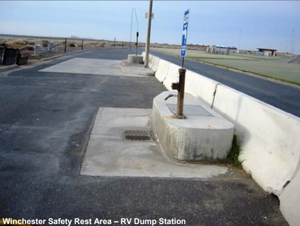
Winchester Safety Rest Area – RV Dump Station