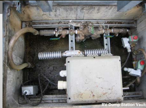
RV Dump Station Vault

In an effort to provide an easily repairable control module for both dinking water and RV dump stations, a standard unit was designed which could be bolted into the vault section of the concrete structure. This module controls the flow of water to the units, and includes valve solenoids to shut the water off after 40 seconds, backflow protection, integrated water line hookups, and a heating unit. In the event of a malfunction of any of the components, the unit can be swapped out with a standard replacement module with very little down time