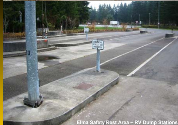
Elma Safety Rest Area – RV Dump Stations