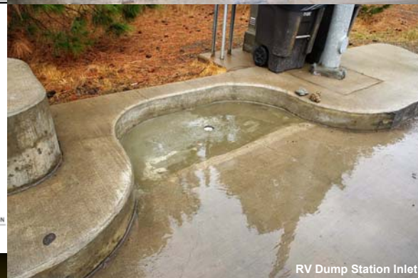
RV Dump Station Inlet