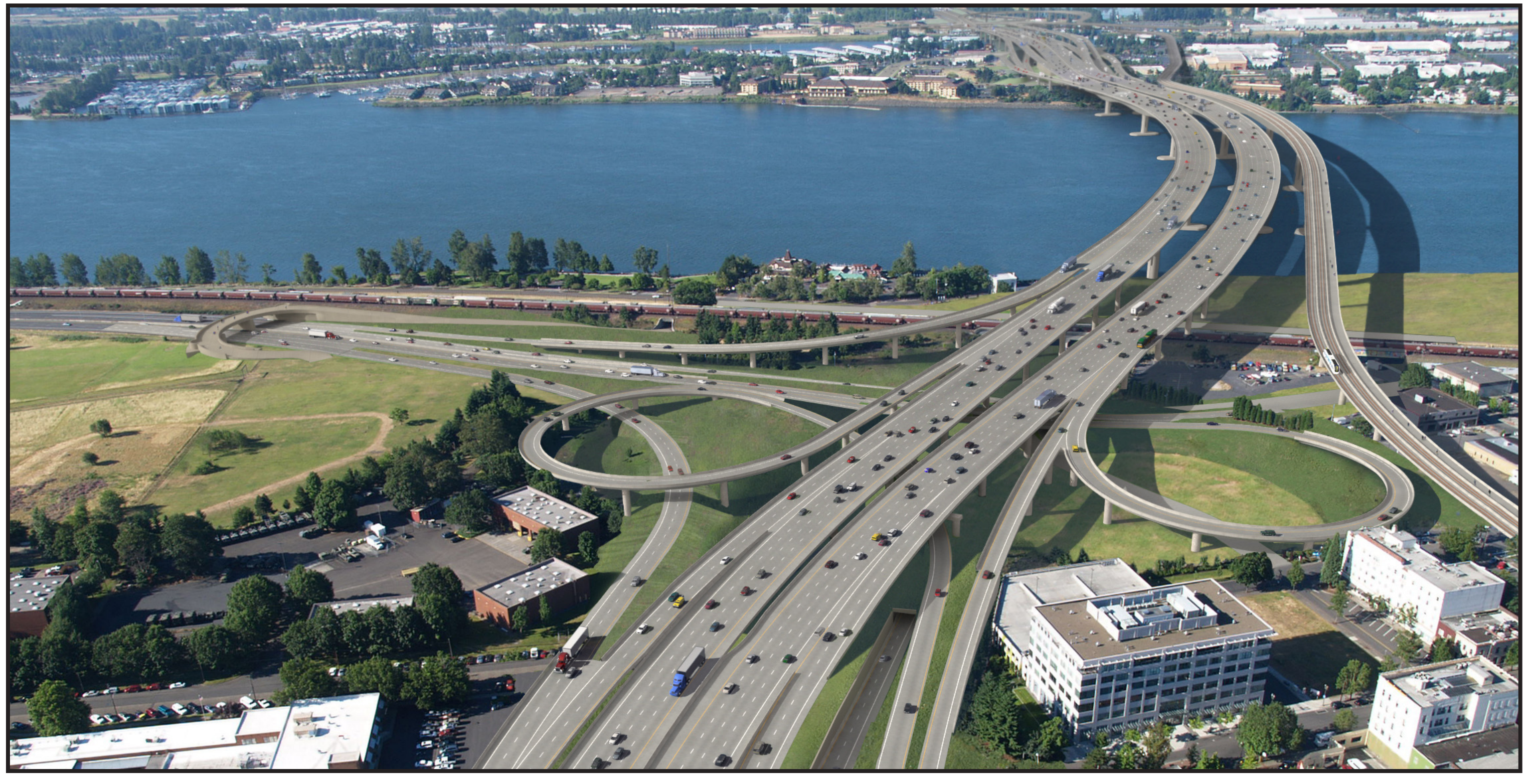
Rendering is for discussion purposes only and is subject to change. Transit alignment could be used for bus rapid transit or light rail. -11/27/07