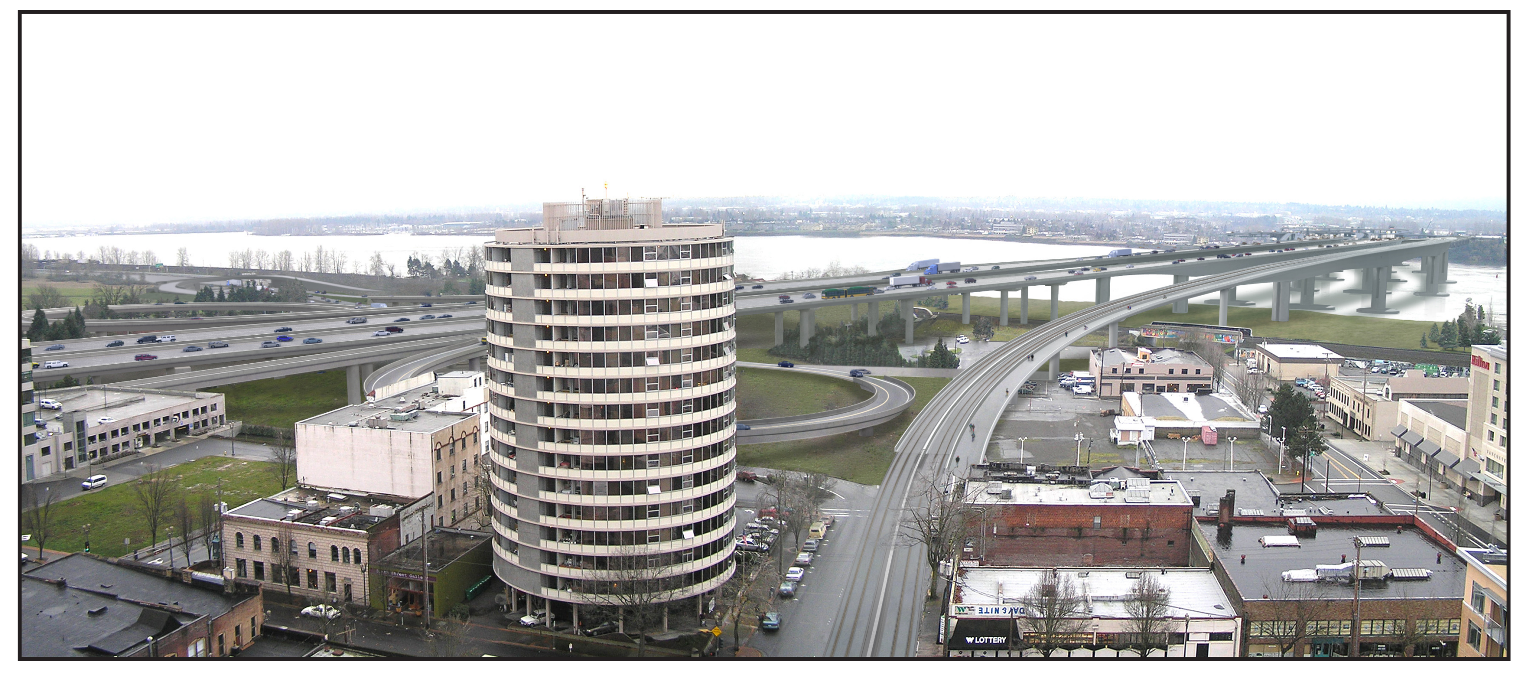
Rendering is for discussion purposes only and is subject to change. Transit alignment could be used for bus rapid transit or light rail. -11/27/07