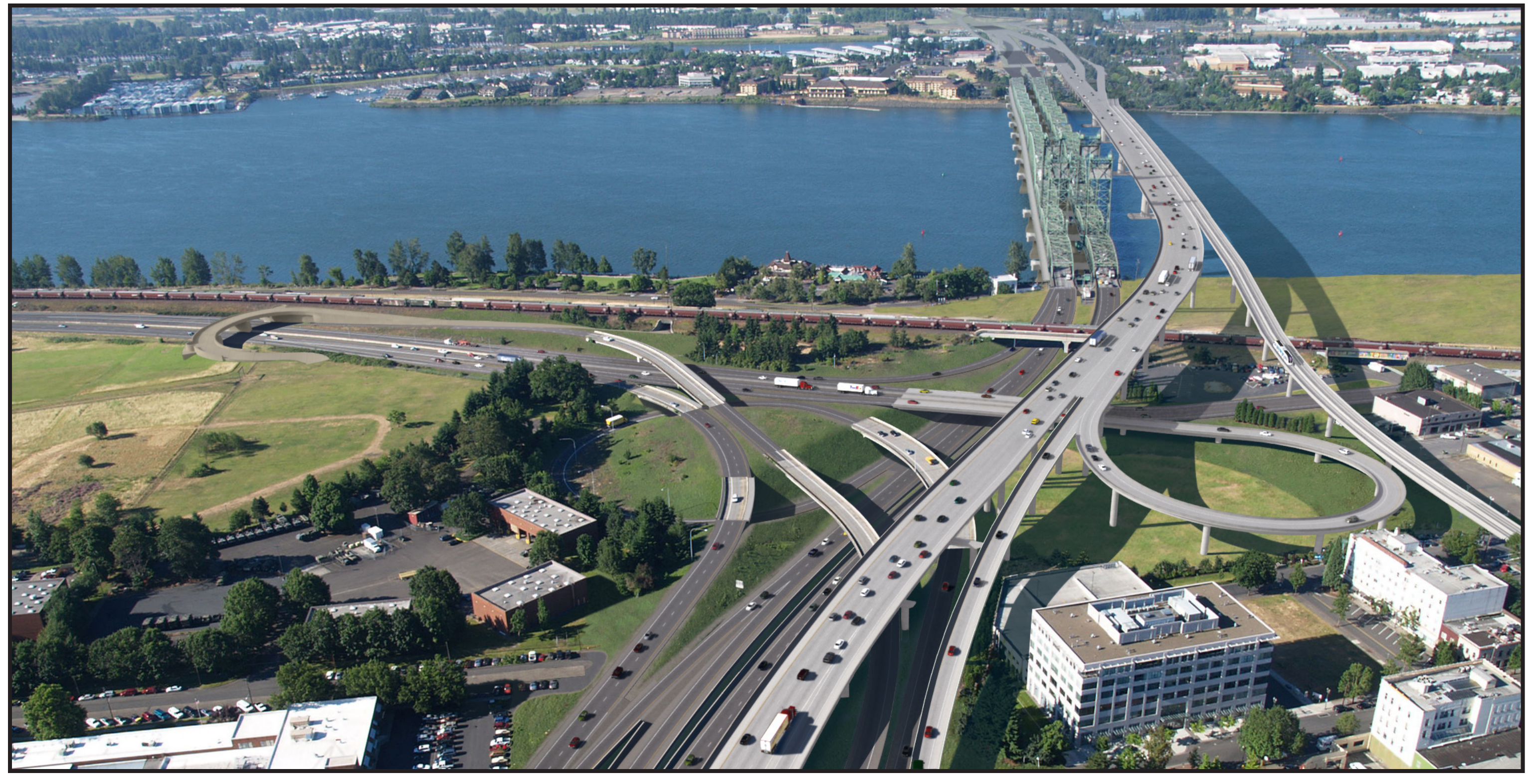
Rendering is for discussion purposes only and is subject to change. Transit alignment could be used for bus rapid transit or light rail. -11/27/07