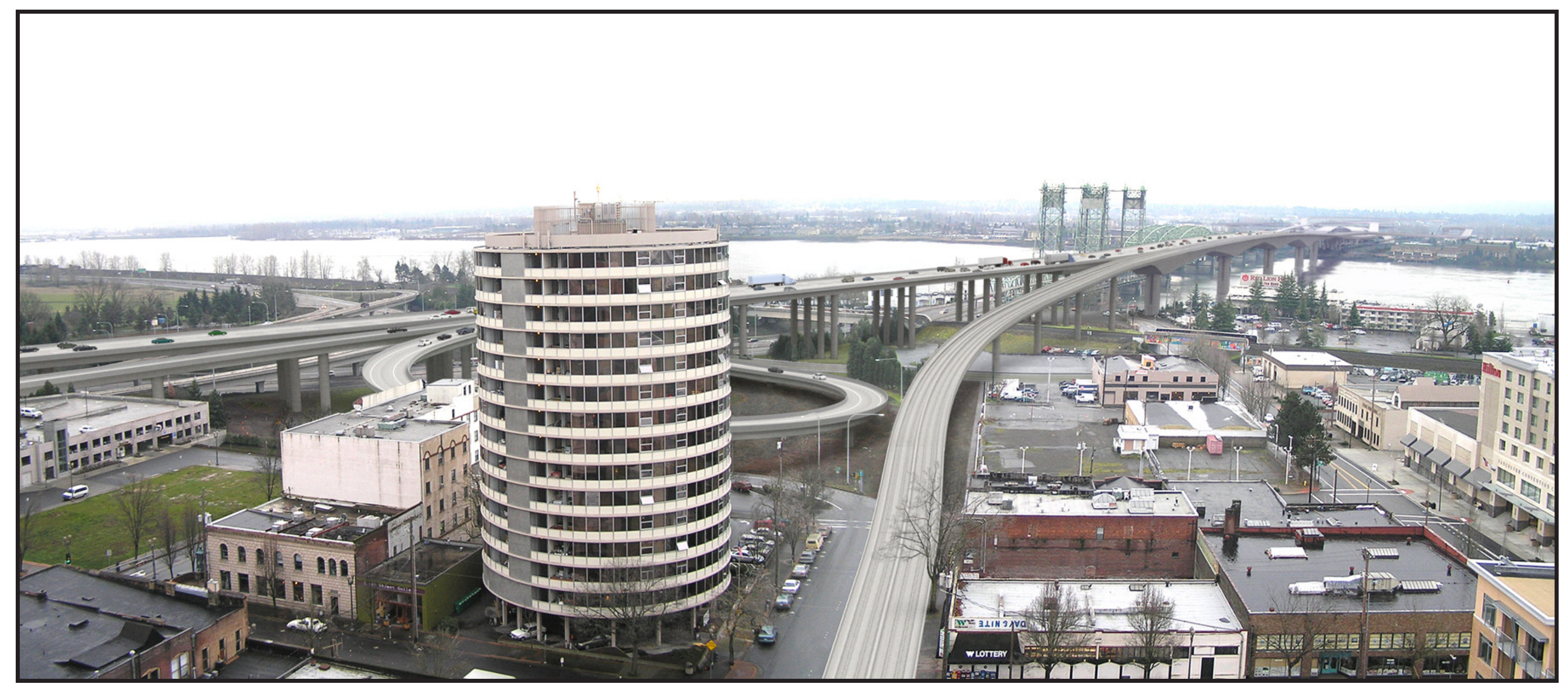
Rendering is for discussion purposes only and is subject to change. Transit alignment could be used for bus rapid transit or light rail. -11/27/07