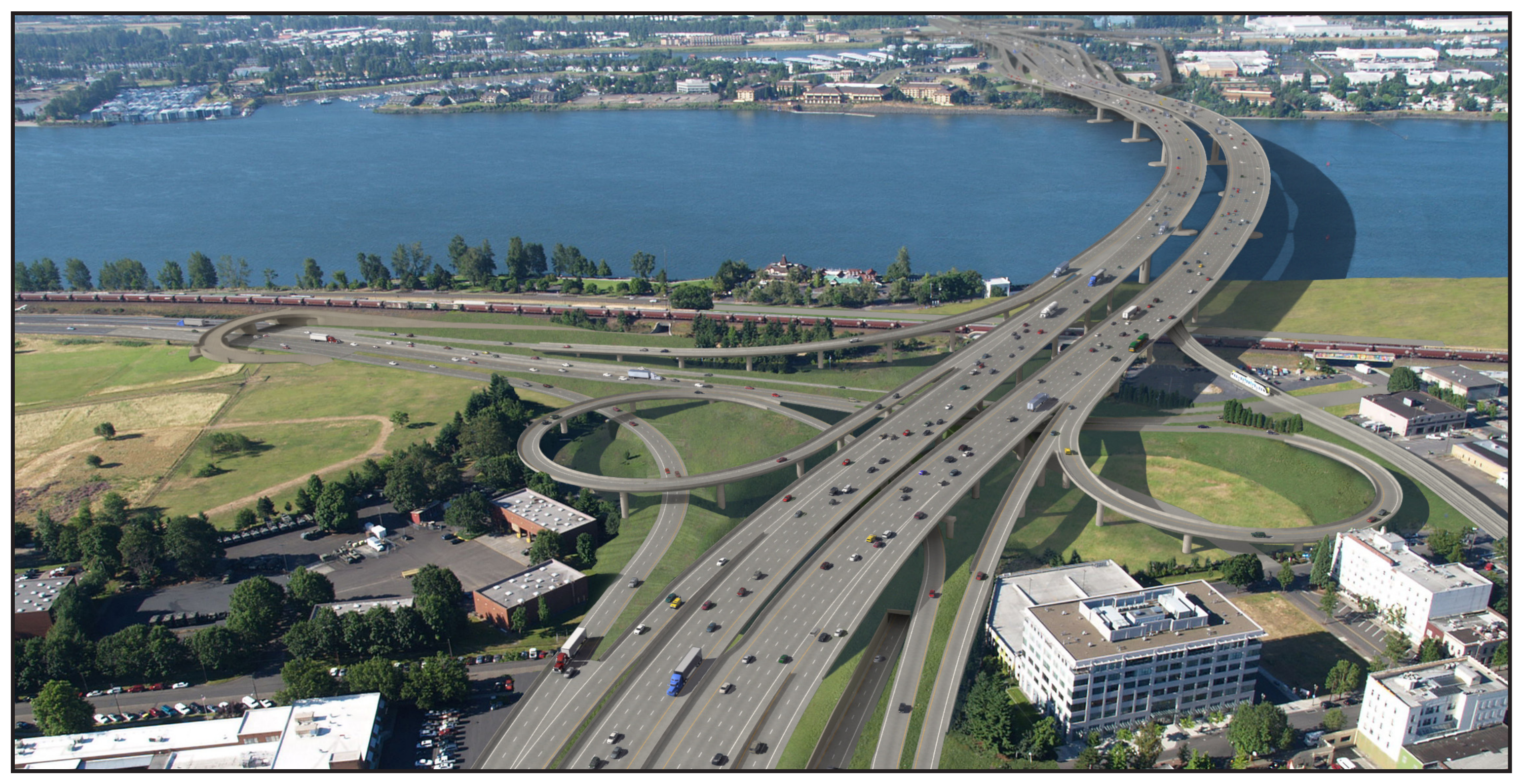
Rendering is for discussion purposes only and is subject to change. Transit alignment could be used for bus rapid transit or light rail. -11/27/07

Replacement Bridge Draft Concept with high capacity transit inside southbound bridge (Stacked Transit/Highway Bridge)