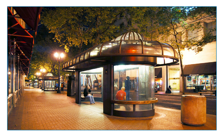
Station lighting increases visibility for those on or approaching platforms.