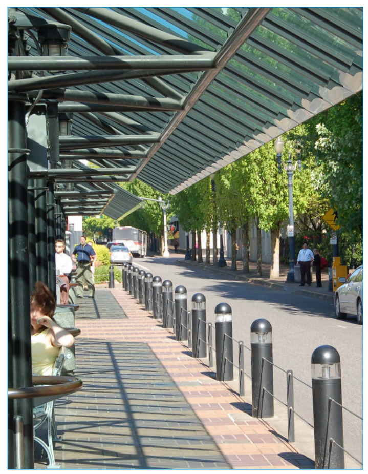
Cable, bollards and distinctive surfaces help define transit, auto and pedestrian areas.

The community and project citizen advisory groups will continue to be consulted as light rail designs are refined to gain input on appearance of the stations and streets, park and ride designs and security plans.