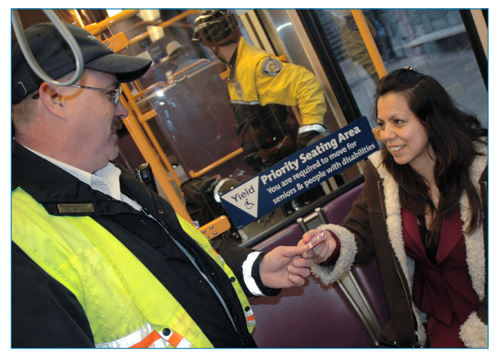
Transit police and fare inspectors help increase passenger safety.