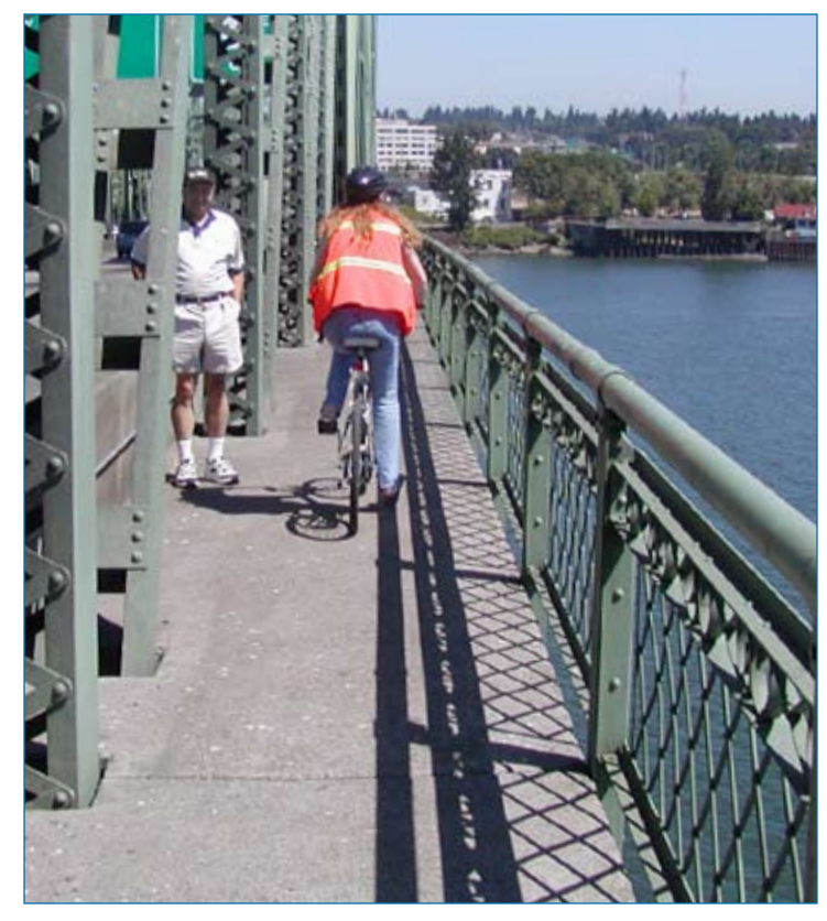
Today's Interstate Bridge paths are too narrow for pedestrians and bicyclists to safely pass each other.