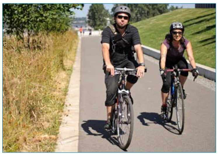
Multi-use paths, bike lanes and sidewalks will be added and improved within the Columbia River Crossing project area.

The CRC project is planning two structures to replace the existing I-5 bridge. These structures will take advantage of space underneath the roadway deck by adding a lower deck between the supporting steel trusses. The northbound structure will carry vehicle traffic above and have a covered path for pedestrians and bicyclists on the lower deck. The southbound structure will carry vehicle traffic above with light rail underneath.