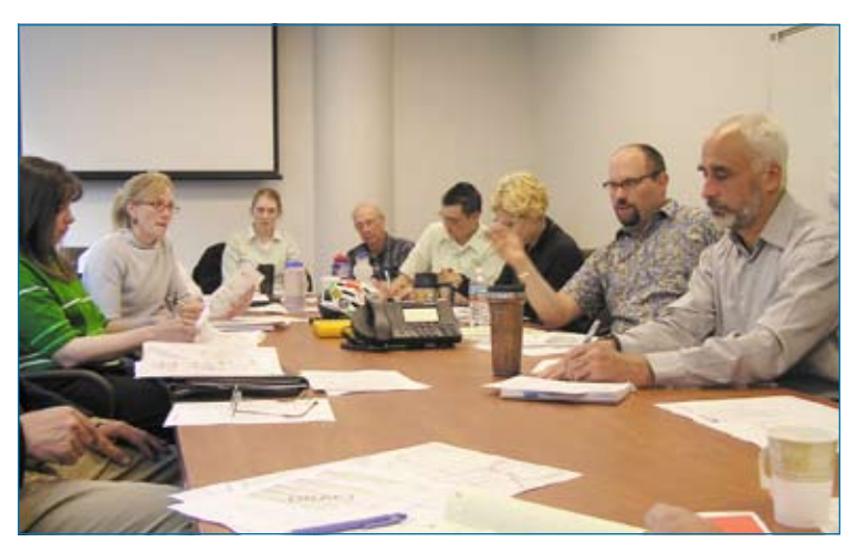
The Pedestrian and Bicycle Advisory Committee (PBAC).

Input on the pedestrian and bicycle facilities also comes from other community sources. The Portland Working Group and Vancouver Transit Advisory Committee, citizen advisory committees focused on transit elements of the CRC project, are providing guidance on access to transit stations and Park and Ride locations. Feedback is also received at project events, by phone and by email. Comments are considered by the project on an ongoing basis and have shaped the project's current design.