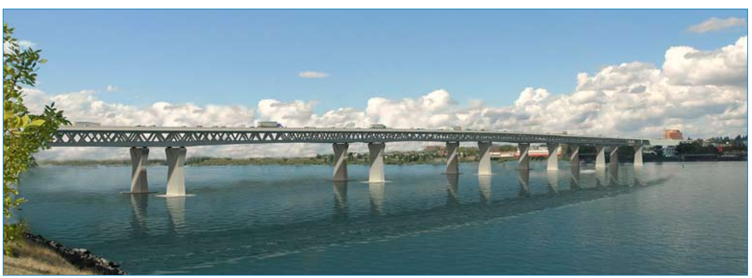
Concept rendering of deck truss bridge for replacement I-5 bridge.