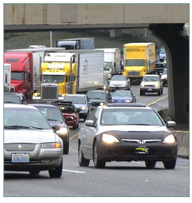
Traffic backs up in Vancouver after an accident on the Interstate Bridge.