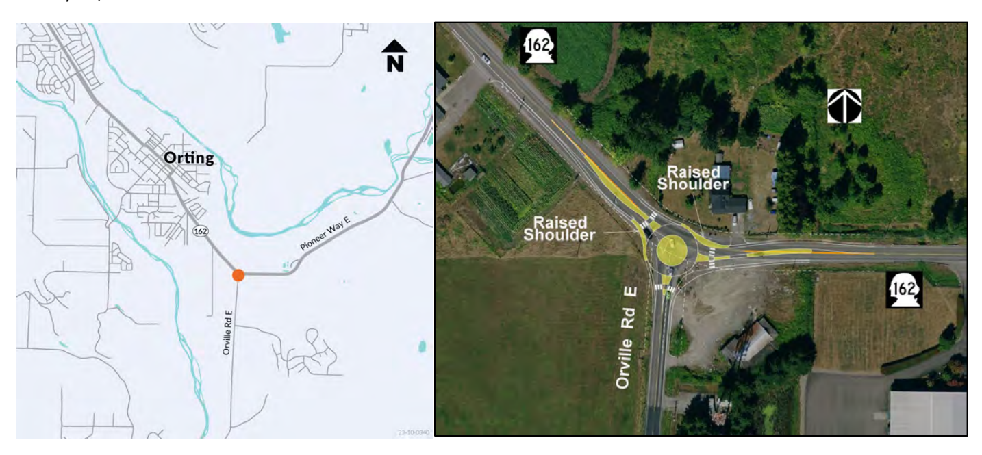
Image Description: Two maps showing the project location southeast of Orting and the proposed roundabout alternative from a bird's eye view.