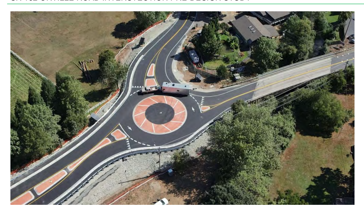
Example of a high-speed single-lane roundabout located in Vancouver, Washington.

How do I drive a roundabout? For information about driving a single lane roundabout, check out this <u>video</u> created by the Virginia Department of Transportation (VDOT) or read our brochure. The VDOT mini roundabout is comparable to WSDOT's single-lane roundabout. (https://www.youtube.com/watch?app=desktop&v=fUFmuf_HRDg)