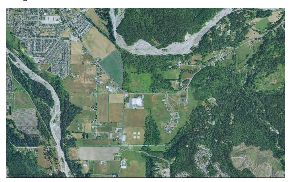
Satellite Map of SR 162 at the Orville Road East intersection near Orting, Washington

As a result of the safety plan, WSDOT is proposing a single-lane roundabout on SR 162 at the Orville Road East intersection near Orting.