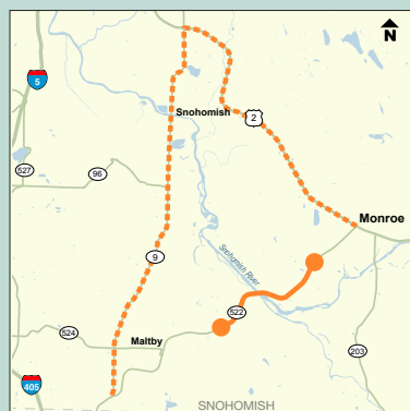
Rock-blasting detour route