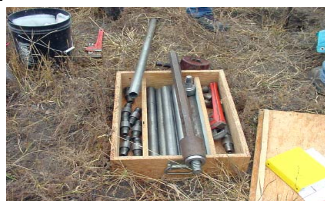
Photo of PP device in the process of being assembled. The threaded coupling devices on the left side of the box are used to connect the cone-shaped tip to lengths forming the body of the penetrometer. The lengths forming the body of the penetrometer are then connected to the section on which the weight slides.