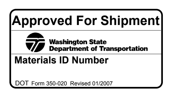
Figure 9-6 Tag

All documentation associated with the tag in Figure 9-6 will be reviewed and approved by the WSDOT Materials Fabrication Inspection Office and kept at the WSDOT Materials Fabrication Inspection Office and kept at the point of manufacture.