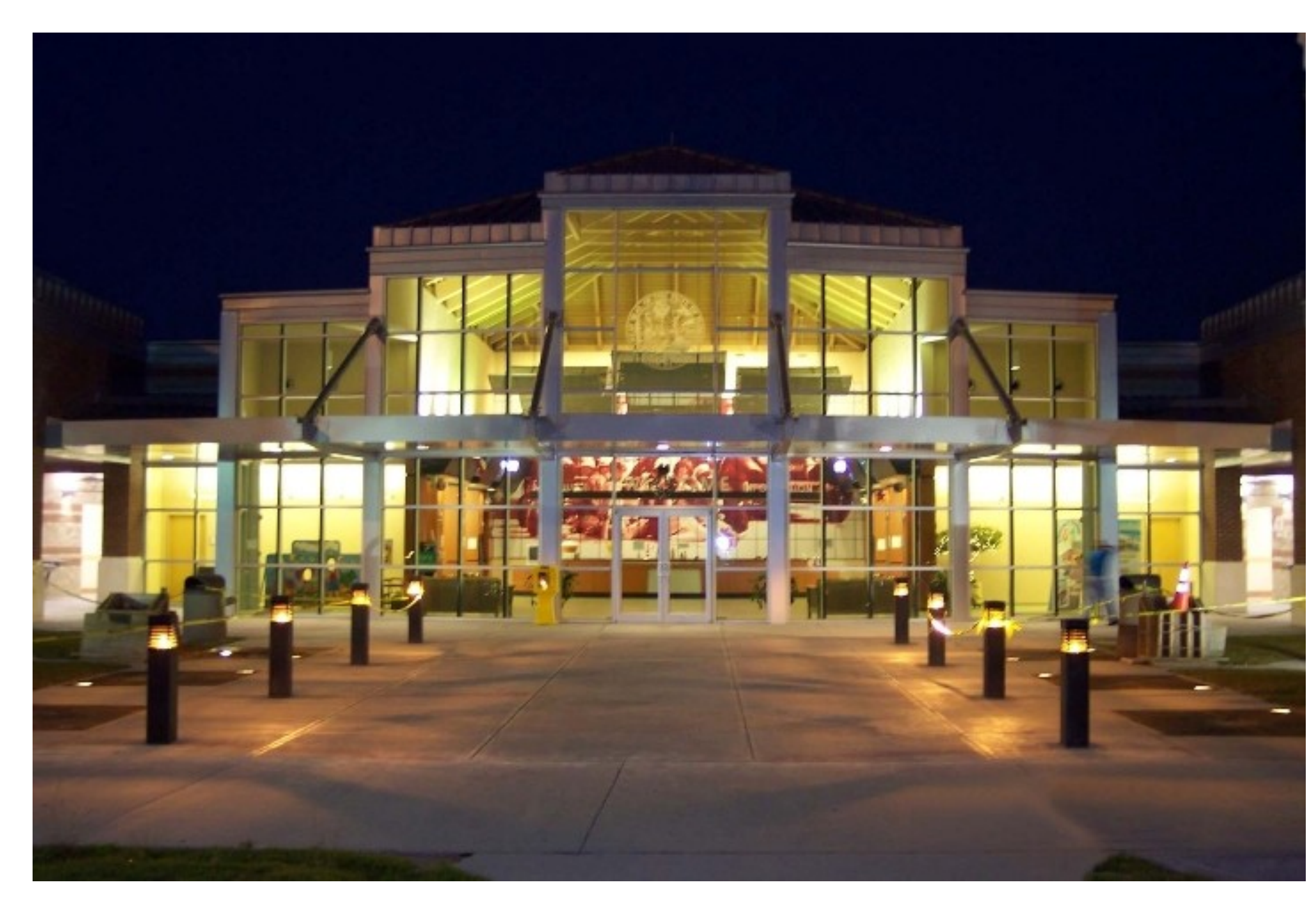
Escambia County Welcome Center—I-10 (Alabama-Florida Border)