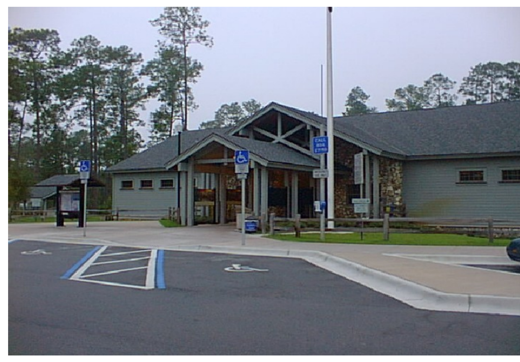
Baker County Rest Area —I-10 (Ocala National Forest, near Jacksonville)