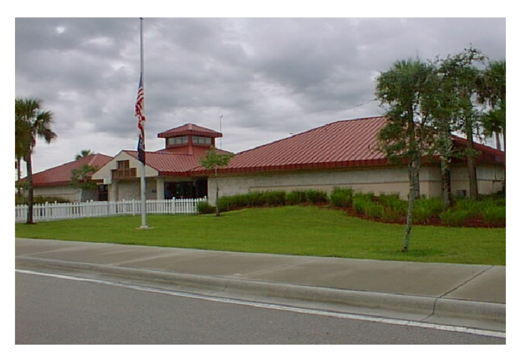
Collier County Rest Area — I-75 (Alligator Alley)