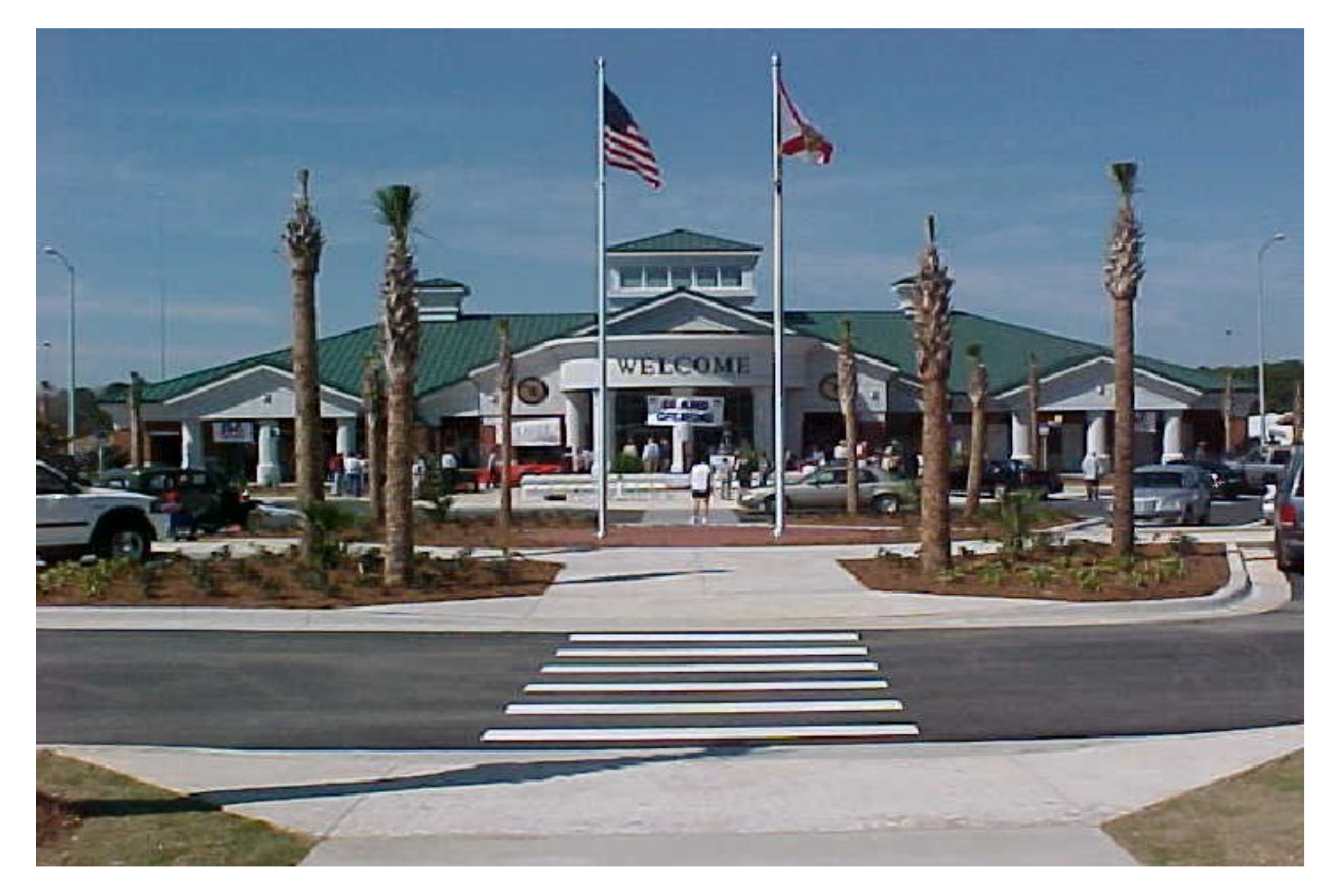
Jackson County Welcome Center—U.S. 231 (Alabama-Florida Border)

Recently reconstructed rest areas meeting new rest area standards to meet CPTED criteria and ADA standards. All facilities include: restrooms & family restrooms; TDDs/TTYs; vending areas (Randolph-Sheppard); picnic shelters & pet-walk areas; auto, truck and RV parking & night-time security. All facilities have 'paired' restroom facilities (2 Men's & 2 Women's).