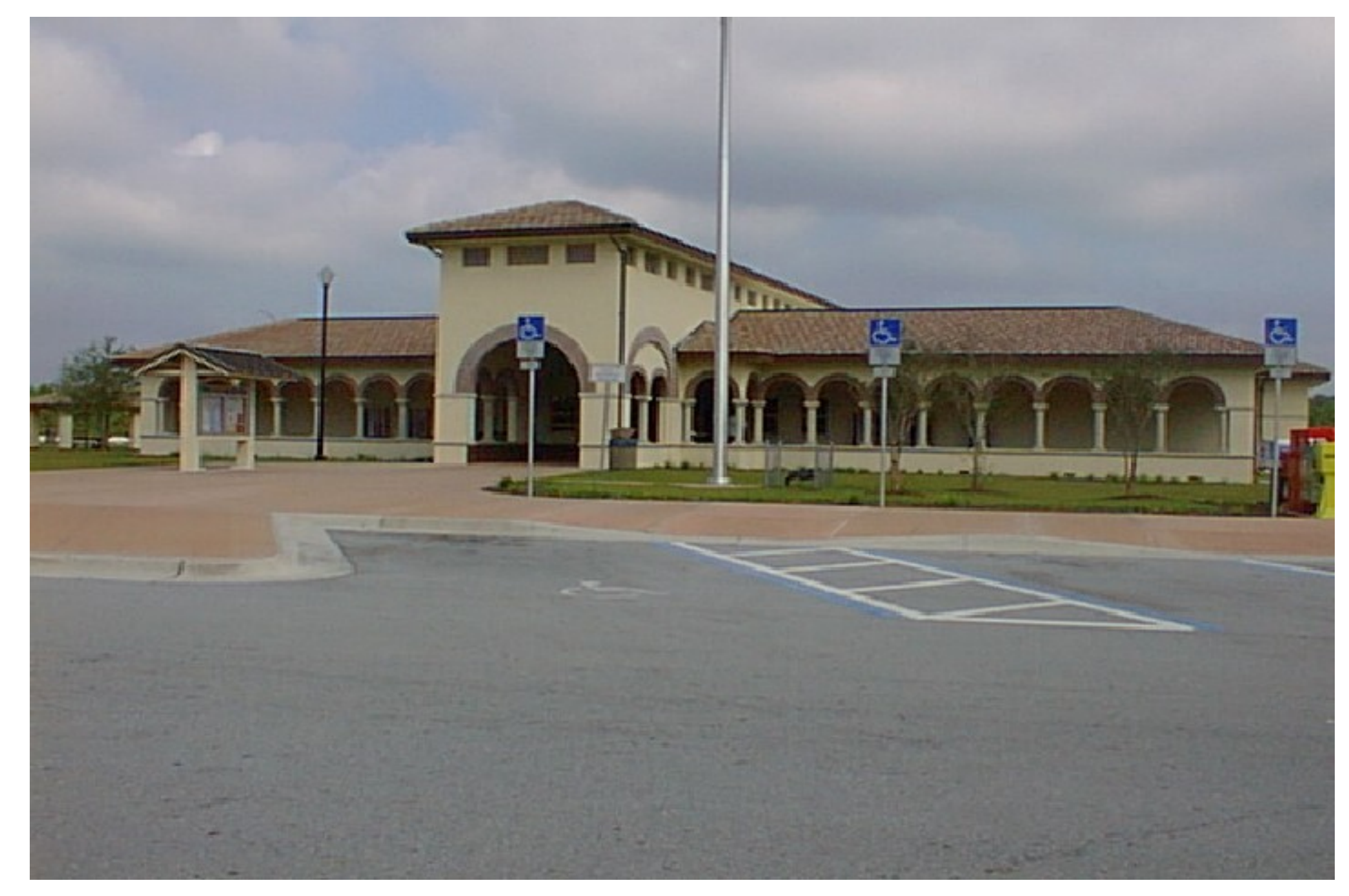
St.Johns County Rest Area — I-95 (near St. Augustine)