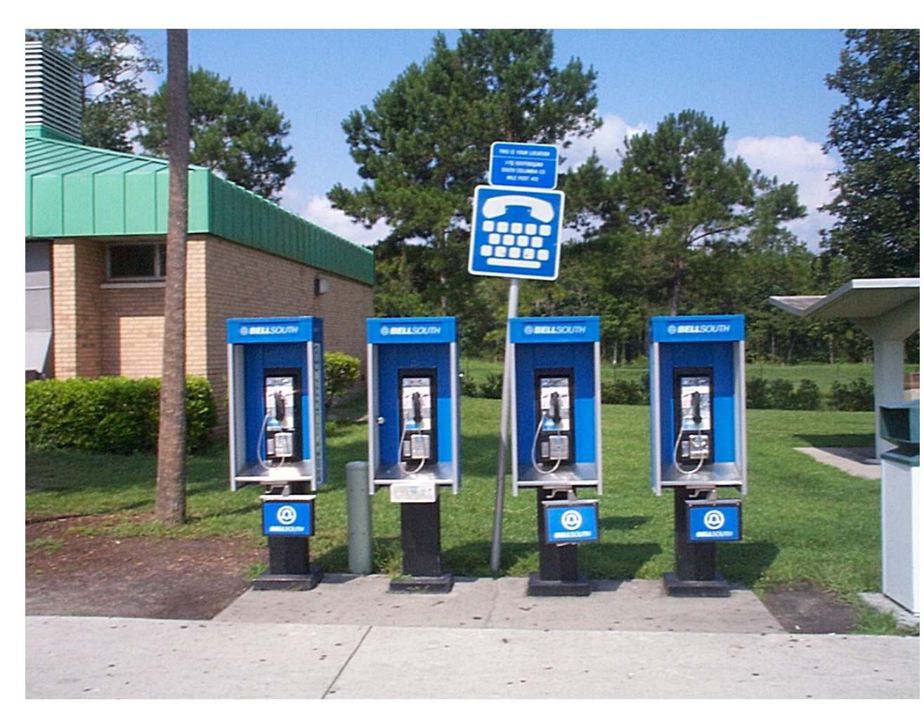
Pay phones with TDD/TTY