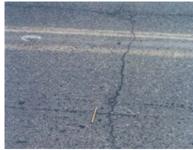
Photo 2. Low Temperature Cracking

Superpave represents an improved system for specifying asphalt binders and mineral aggregates, developing asphalt mixture design, and analyzing and establishing pavement performance prediction 1 .