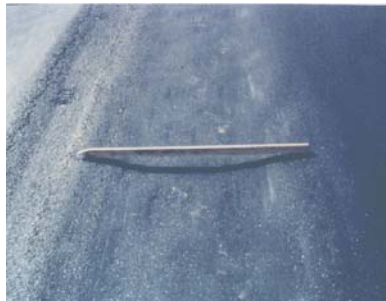
Photo 1. Rutting

The Superpave system primarily addresses two pavement distresses: permanent deformation (rutting) and low temperature cracking. The unique feature of the Superpave system is that it is a performance-based specification system – the tests and analyses have direct relationships to field performance 1 .