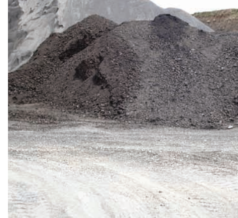
Reclaimed Asphalt Pavement (RAP) pile at an asphalt paving company yard.