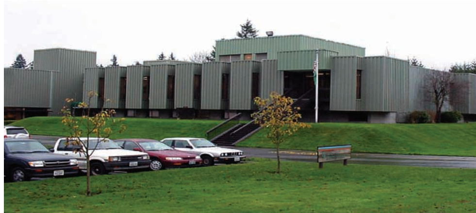
WSDOT's State Materials Lab, located in Tumwater.

Additionally, WSDOT's State Materials Lab reviewed chemicals stored in the Chemistry Lab, evaluating the real need for having them on hand. By reducing those chemicals on hand (eliminating over 600 chemicals) we reduced consumption, the risk of storing potentially hazardous chemicals and the associated costs. Now, if we need a specialty chemical for a specific test, small quantities are ordered and after completion of the expected testing the remainder is recycled, greatly reducing hazardous chemical storage onsite.