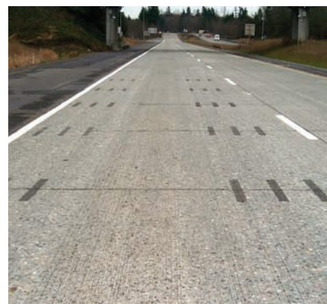
Completed Dowel Bar Retrofit (DBR) Project. Finished DBR project shows typical markings where dowels were placed in the old concrete pavement, strengthening the pavement and extending its life.