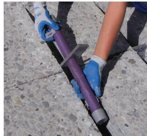
A contractor installs dowel bars into a slot on a Dowel Bar Retrofit project. The dowels strengthen the joint between concrete panels, transferring heavy truck loads from panel to panel.

Dowel Bar Retrofit (DBR) extends the pavement life of old concrete pavements. Adding dowel bars and grinding old concrete pavement smooth adds years to the life of these pavements. Extending pavement life reduces consumption, improving sustainability, while also saving money. WSDOT is a nationwide leader in the design and implementation of dowel bar retrofits.