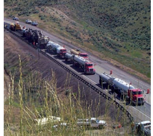
A cold-in-place (CIP) recycling train.

20% rate, the Washington Asphalt Pavement Association reports that WSDOT is using all of the RAP it is producing through pavement rehabilitation.