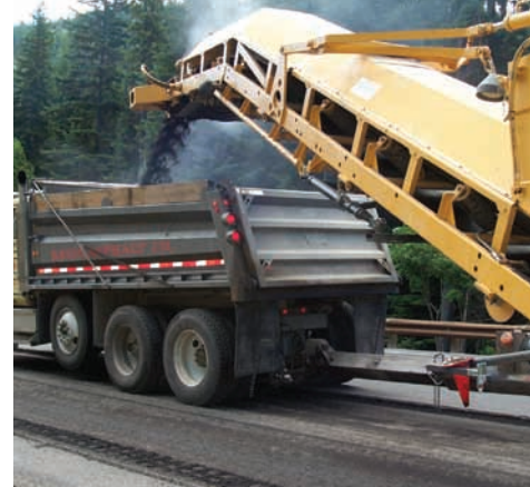
Milling operation, removing worn asphalt wearing surface and hauling it back to the asphalt plant to be reused. Typically only the top two inches of the wearing surface are removed, leaving the rest of the pavement intact.

Heating the aggregate and the asphalt binder to make asphalt pavement is expensive and consumes considerable fuel (diesel of lower grades of bunker fuel). Warm Mix Asphalt (WMA) uses special modifiers that lower the mixing temperature for asphalt. Decreases of 50 F or more are possible. We placed our first test section on I-90 in 2008 and more will follow.