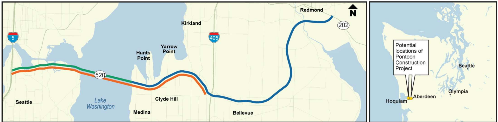
Program area map.