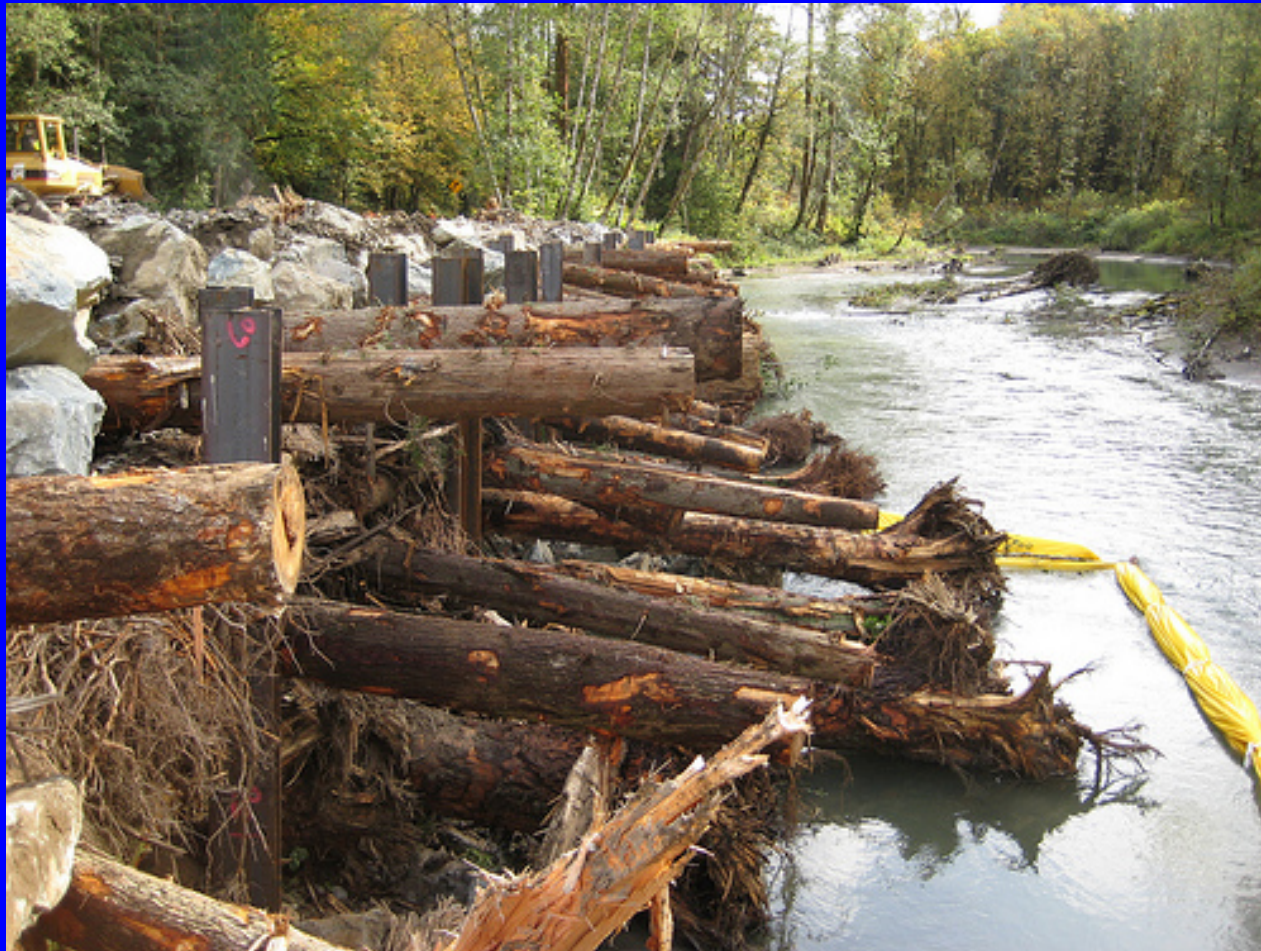
Pile and Log Crib Wall