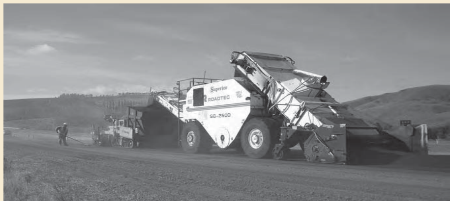
Contractors lay HMA on I-82 in south central Washington.

3 The 2003 Nickel Transportation Funding Package was passed after the projection was made for 2003. WSDOT subsequently awarded five projects from the Nickel funding package with a combined total of 315,285 tons of HMA.