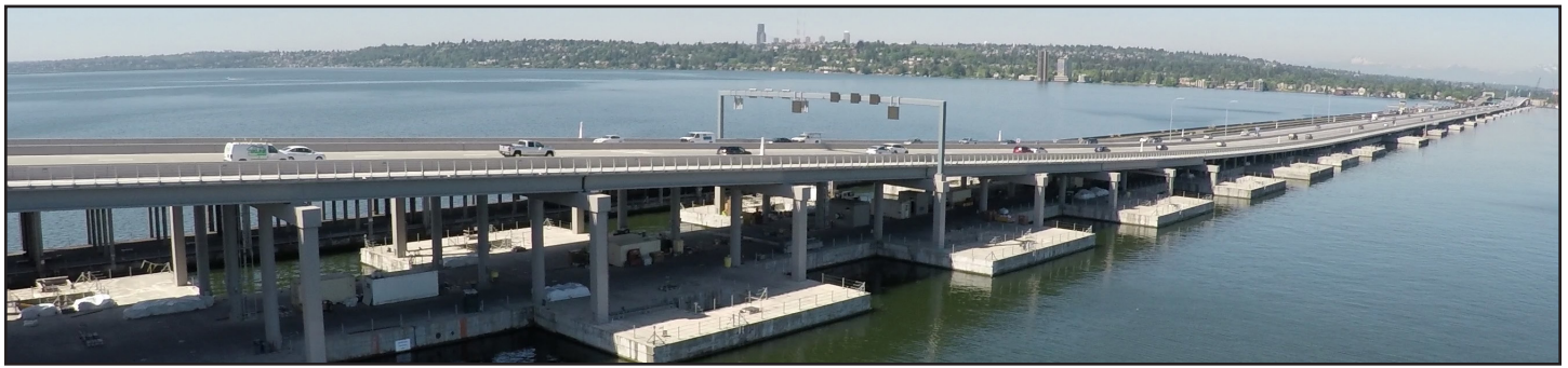
The new floating bridge includes two general-purpose lanes and one transit/HOV lane in each direction, and a bicycle /pedestrian path.