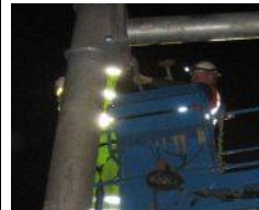
Crews install a gantry pole on SR 167.