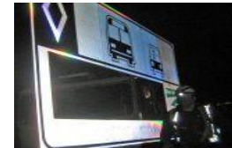
Crews prepare to install VMS sign on SR 167.