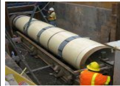
Crews install liner for water pipeline in Tukwila.