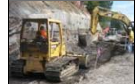
Road crews build a retaining wall along southbound I-405.