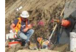
A worker installs soil nails for a new retaining wall.