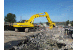
Crews continue to remove a portion of the Oakesdale bridge.