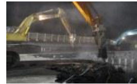
Crews use a hydraulic hammer to break up the concrete from the old bridge.