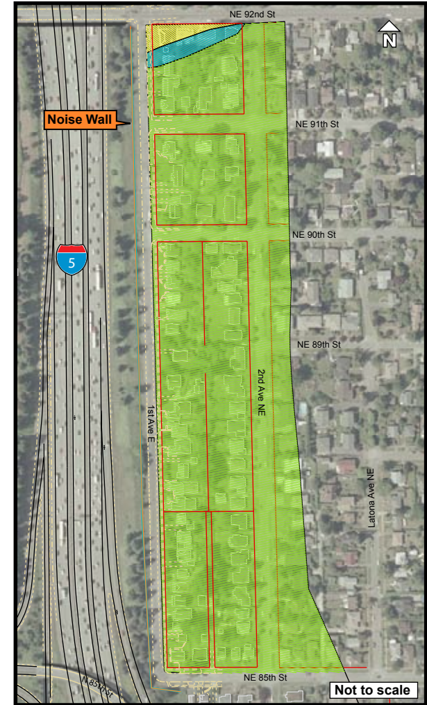
Anticipated noise levels with noise wall will be reduced by up to 9 dBA.