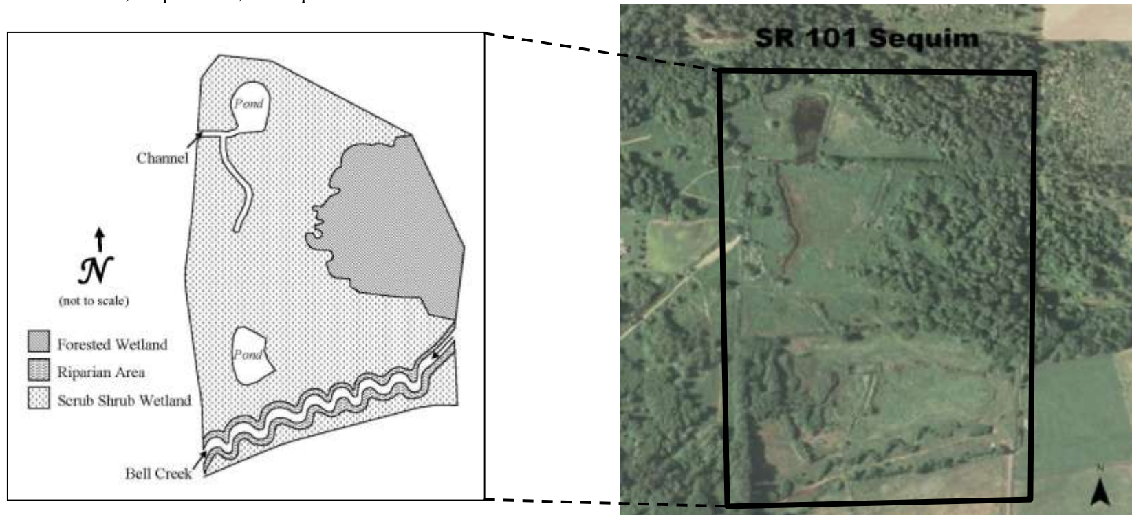
Figure 1 Site Sketch

This 57.43-acre mitigation site (Figure 1) northeast of Sequim, combines wetland restoration, enhancement, and preservation as well as riparian corridor and stream realignment. This site was created to compensate for the loss of 8.94 acres of wetland and advanced mitigation for an additional 6.89 acres of wetlands. The wetland losses result from the creation of a bypass road on US 101 to relieve congestion and improve safety in Sequim. Emergent, open water and buffer areas were created to diversify habitat, enhancing existing scrub-shrub and forested wetland communities. The addition of large woody debris, perch poles, and bat boxes increase habitat value and function. Bell Creek was realigned, creating a riffle and pool complex, improving habitat for anadromous fish, amphibians, and aquatic macroinvertebrates.