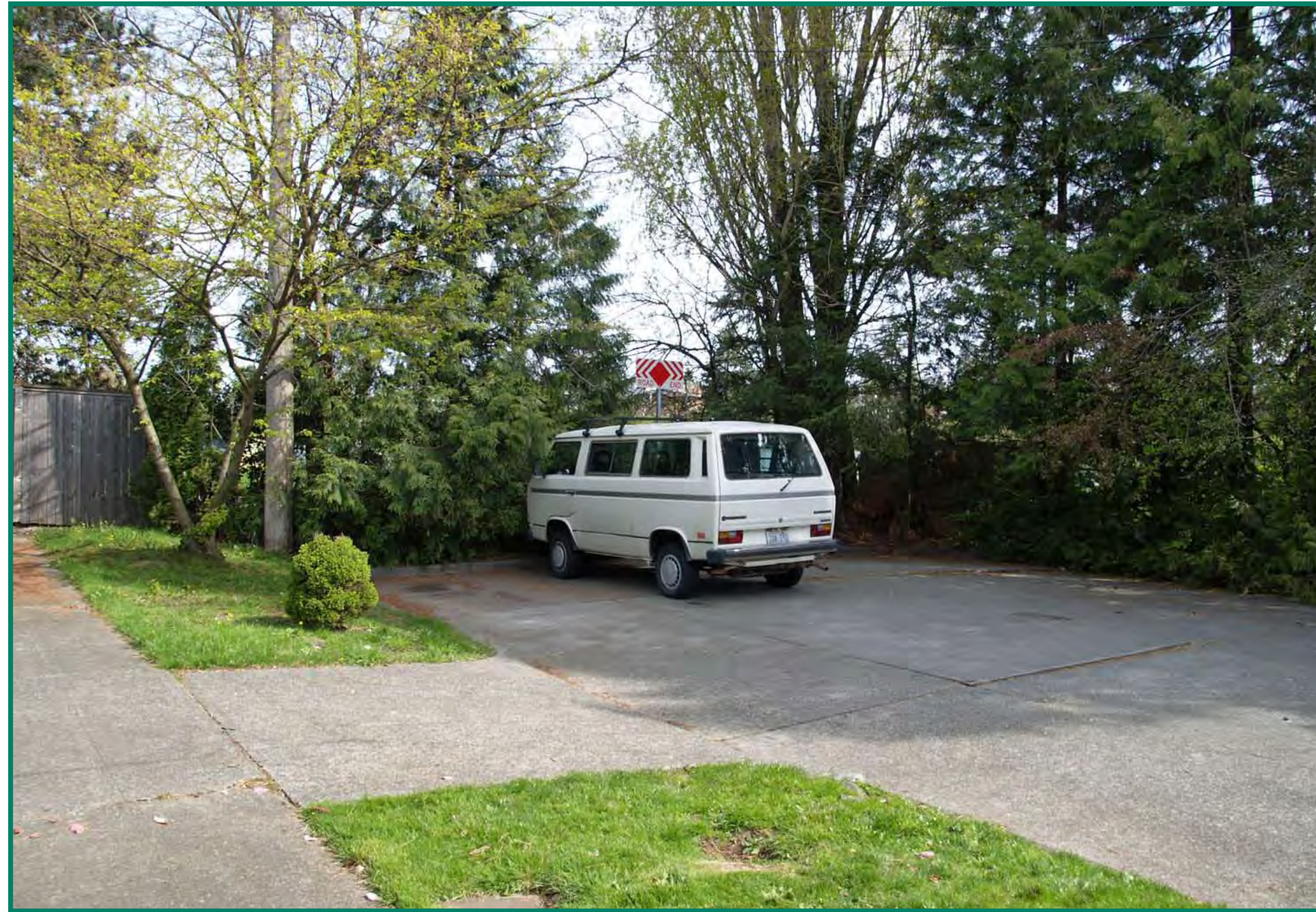
Existing conditions at 1st Avenue NE looking northeast