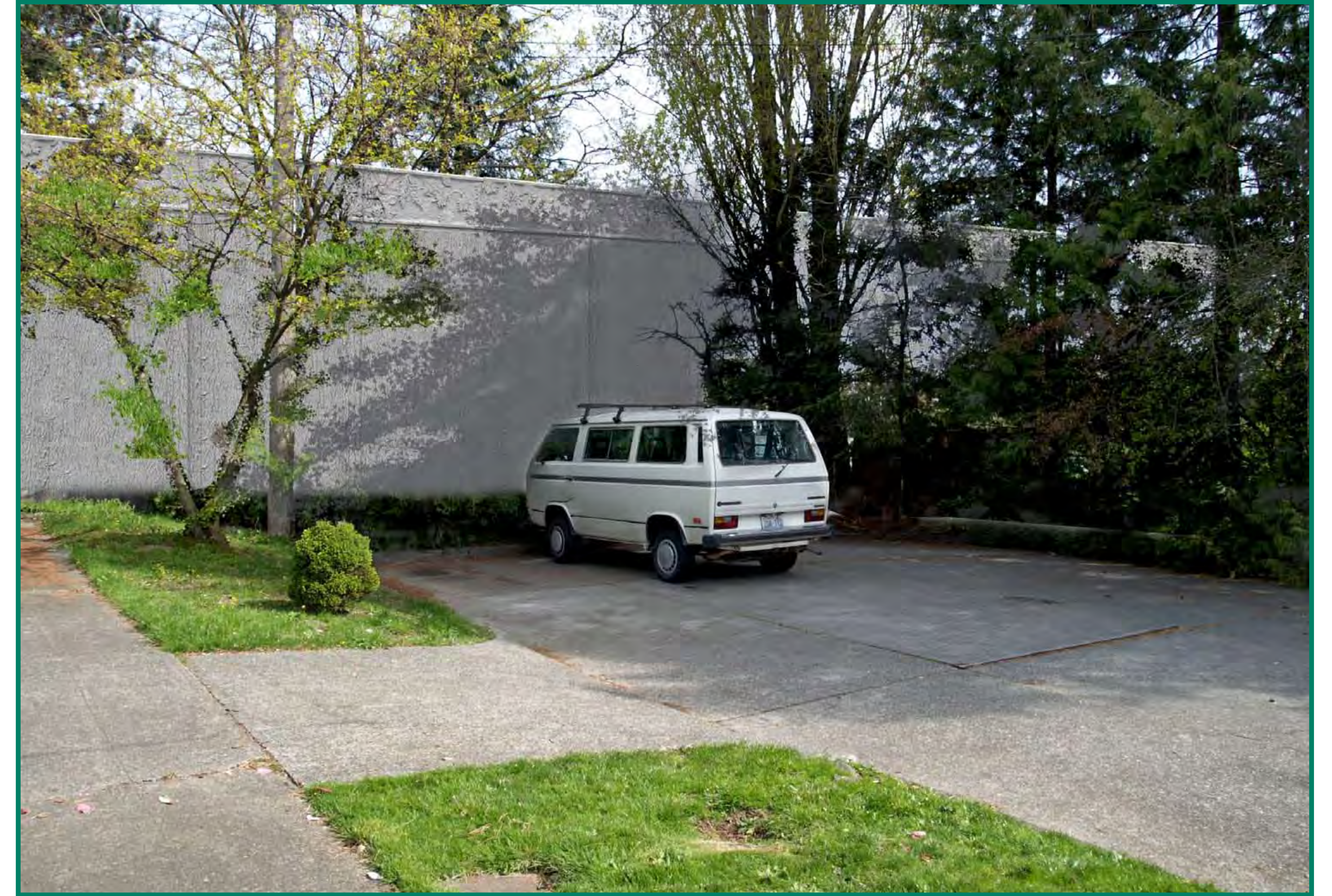
Preliminary conceptual rendering