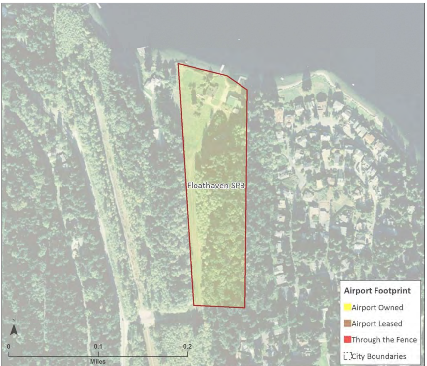
Exhibit 1 Airport Footprint Map

When reviewing your airport footprint map, keep in mind that some footprints will show rights-of-way and other irregularities that do not affect the underlying analysis.