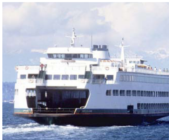
Washington State Ferries