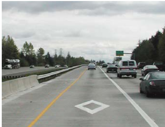
New I-5 HOV

These two projects widen the highway, providing an additional lane for traffic in each direction which helps ease congestion and improve safety between Bellingham and the Canadian border. Construction will be complete in fall of 2009.