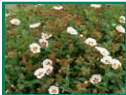
Snow Fire Rock Rose