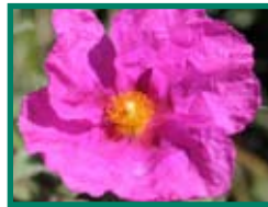
Sunset Rock Rose

As part of the project, crews will weed, water and replace failing plants on the neighborhood side of the noise wall for three years to help establish new plants. After three years, continued care of the landscaping will require community effort to ensure ongoing success.