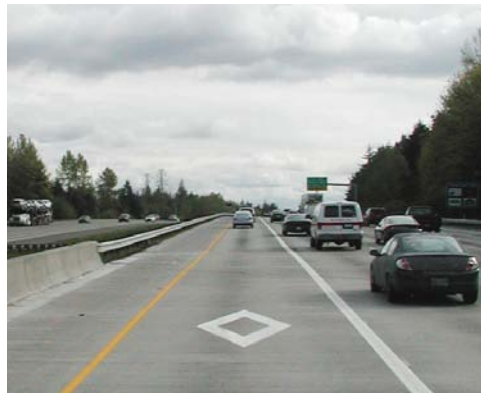
New I-5 HOV.

www.wsdot.wa.gov/Projects/SR539/TenmileBorder These two projects widen the highway, providing an additional lane for traffic in each direction and helps ease congestion and improve safety between Bellingham and the Canadian border. Construction will be complete in fall of 2009.