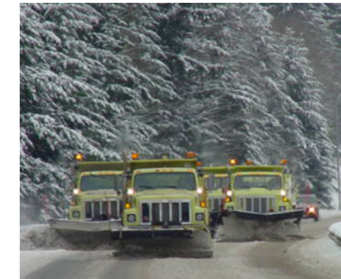
Snow plows and sand trucks.

Highway maintenance will be ready with over 70 additional personnel stationed along the I-5 Corridor and border crossing routes. There will also be over 25 additional pieces of equipment at the ready. WSDOT may also have to provide increased snow and ice materials for the safety and convenience of Olympic travelers.