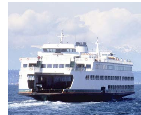
Washington State Ferries.

Traveler and tourism information—providing accurate real-time information about road and traffic conditions at border crossings and on I-5 will help to manage the 4,000-8,000 additional daily trips