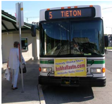
Helping people get to work and back home

Paratransit/Special Needs grants support public transportation for persons who, because of their age, disabilities, or income status, are unable to provide