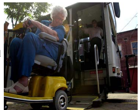
Providing mobility for people with disabilities

FTA allows funding to be used for operating capital, and planning purposes.