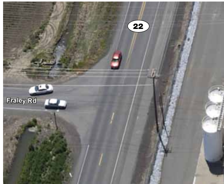
Existing Conditions The existing intersection of SR 22 and Fraley Road has narrow lanes and shoulders.