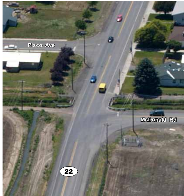
Existing Conditions The existing intersection of SR 22 and McDonald Road has narrow lanes and shoulders.