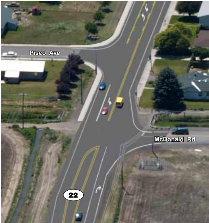
Design Concept Crews will reduce wait times and the risk of rear-end collisions by constructing left- and right-turn lanes at the intersection of McDonald Road.