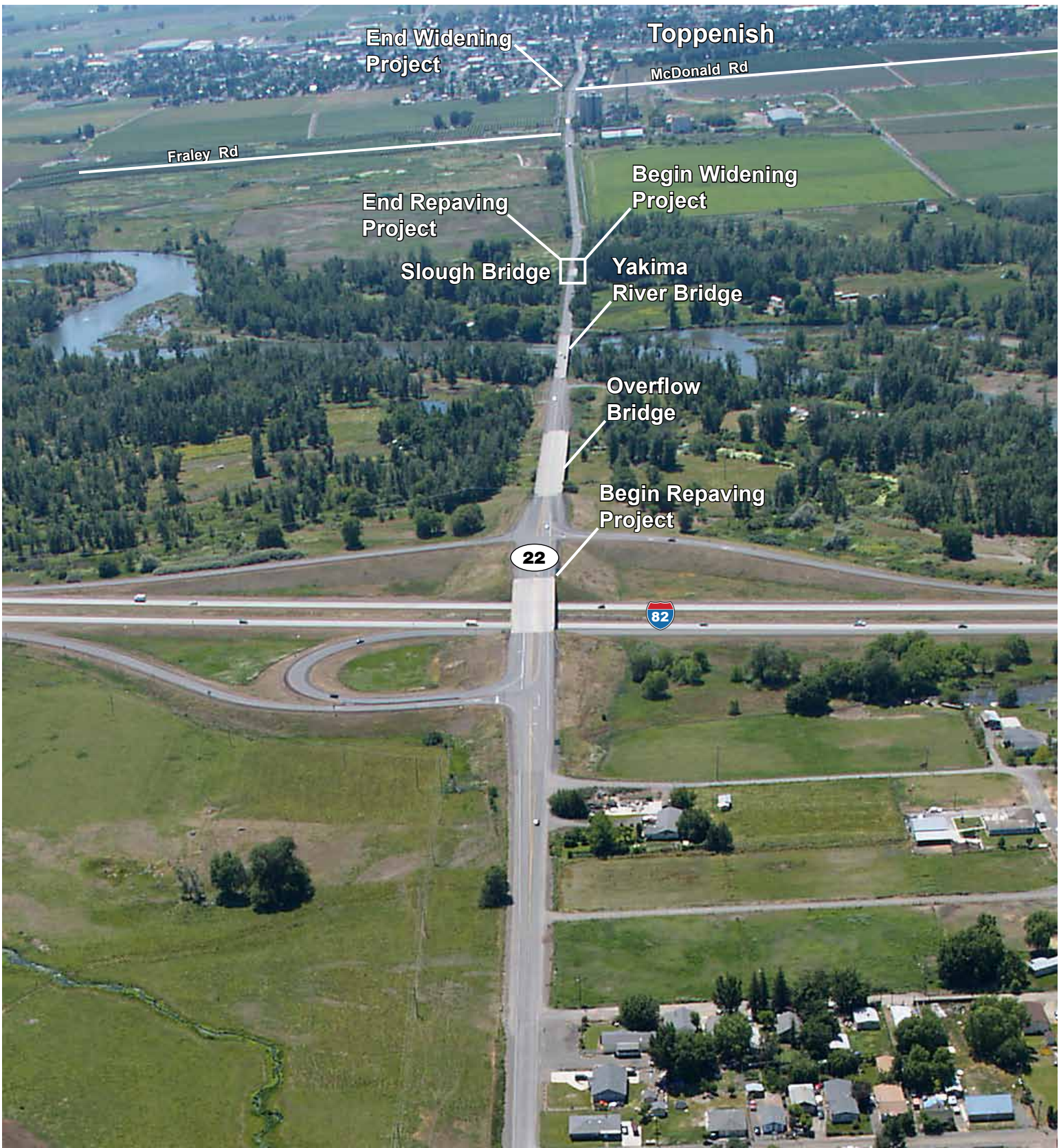
Project Area Looking south at project area from I-82.