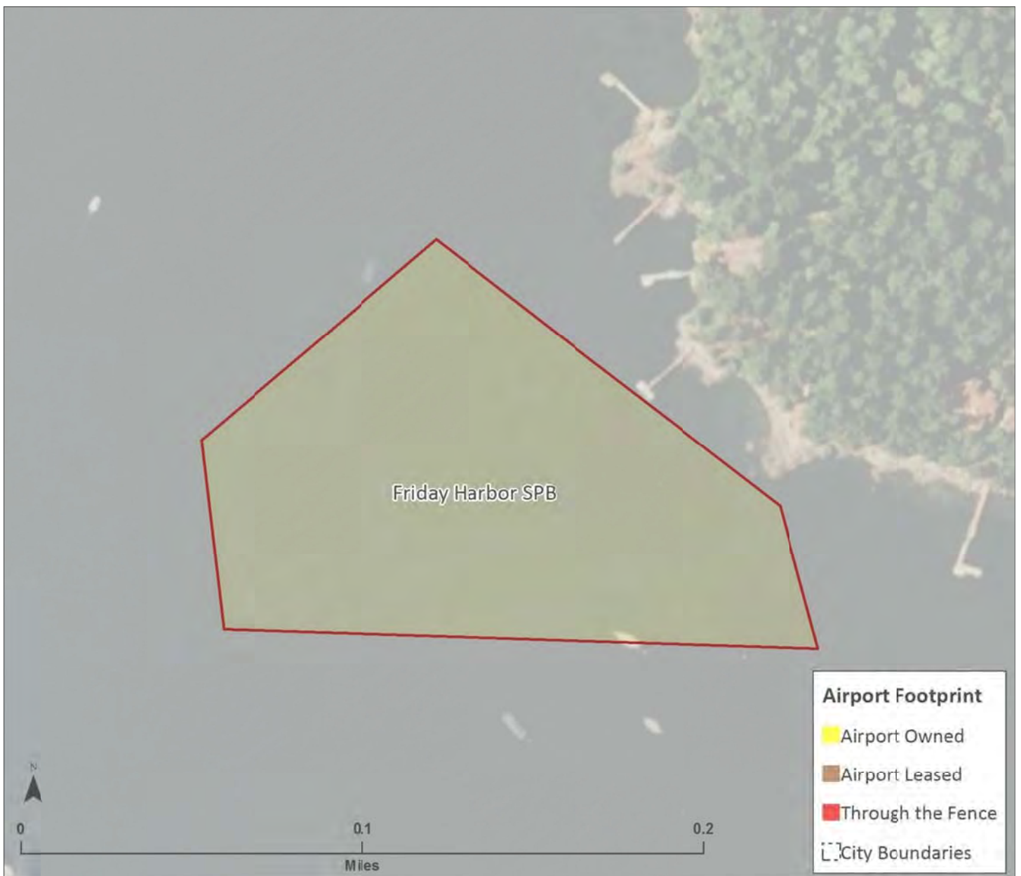
Exhibit 1 Airport Footprint Map

When reviewing your airport footprint map, keep in mind that some footprints will show rights-of-way and other irregularities that do not affect the underlying analysis.