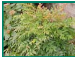
Gulf Stream Nandina