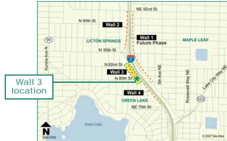
* Photo was taken from this location