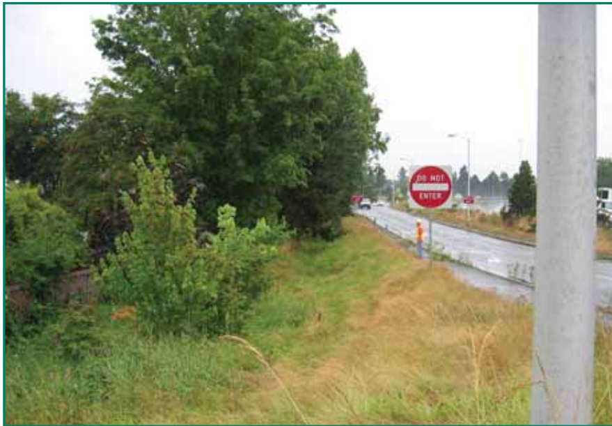
Existing conditions at N 80th Street looking north