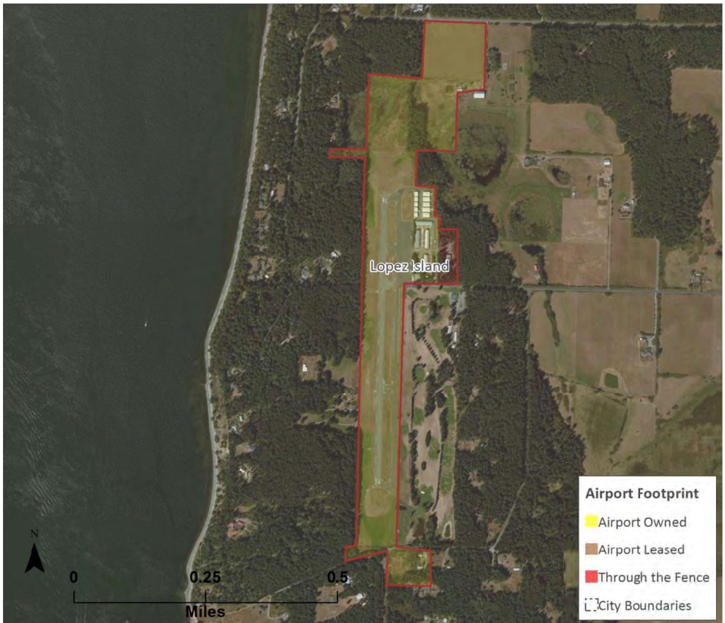
Exhibit 1 Airport Footprint Map

When reviewing your airport footprint map, keep in mind that some footprints will show rights-of-way and other irregularities that do not affect the underlying analysis.