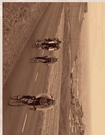
A Bicycle Guide Map for Kennewick, Pasco, Richland and West Richland, Washington