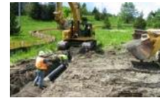
Crew constructs a retention pond near northbound I-5.