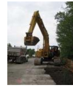
Tukwila Parkway on-ramp to northbound I-405: A crew makes room for a new retaining wall