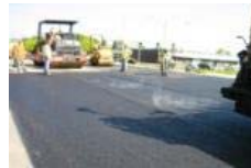
Tukwila Parkway on-ramp to northbound I-405: Crew naves the reconstructed on-