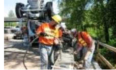
Crew adds concrete for the "coping" of a new retaining wall along northbound I-405 near SR 181.