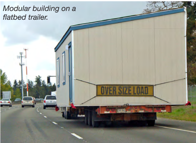
Modular building on a flatbed trailer.