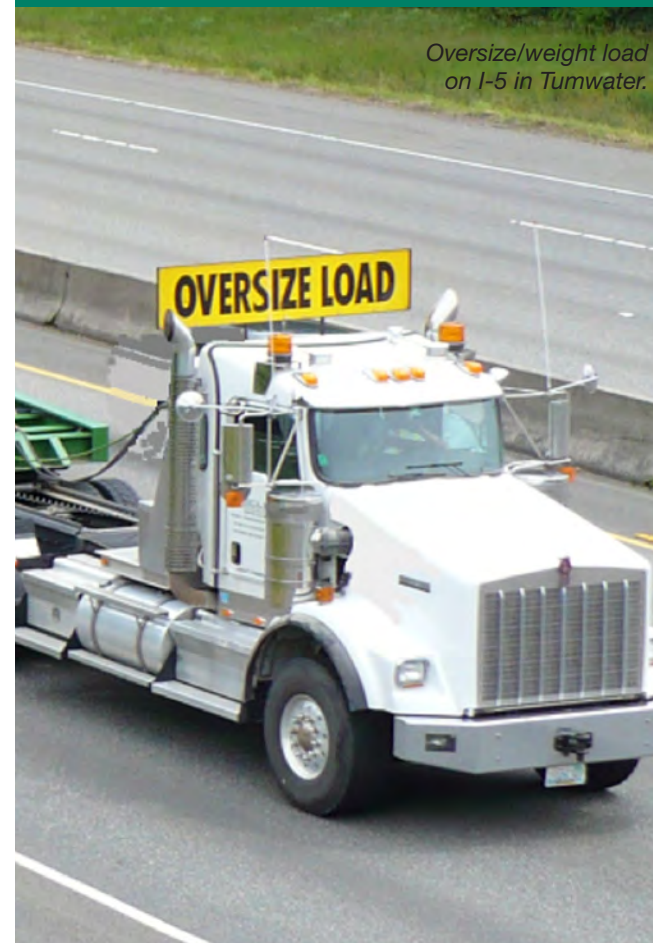
Oversize/weight load on I-5 in Tumwater.