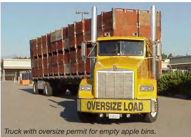
Truck with oversize permit for empty apple bins.