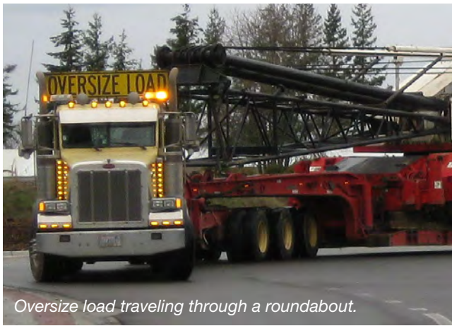
Oversize load traveling through a roundabout.