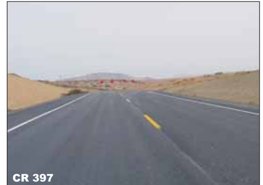
Phase 1 - Completed November 2004