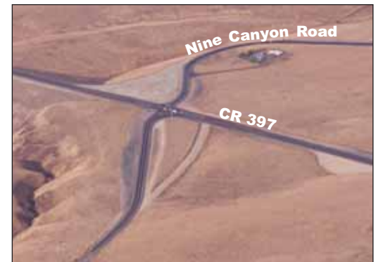
Phase 2 - Completed November 2006 Nine Canyon Road Intersection Looking Northwest