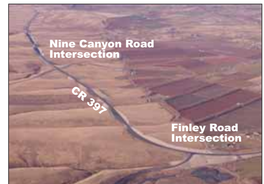
Phase 2 Finley Road Intersection Looking North