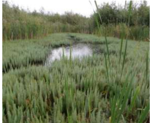
Photo 1 – Herbaceous cover in the emergent wetland (September, 2010)

The aerial cover of native woody species in the scrub-shrub and forested wetlands is qualitatively estimated to be 90 percent (Photo 2 – next page). Dominant species observed in these zones include Pacific willow ( Salix lucida ssp. lasiandra ), Hooker's willow ( Salix hookeriana ), twinberry honeysuckle ( Lonicera involucrata ), and red alder. All dominant species and virtually all other species present in these zones are FAC or wetter, therefore the second performance standard requirement has been achieved.