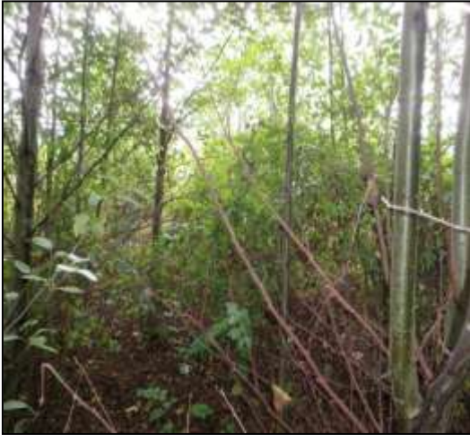
Photo 2 – Woody cover in the scrub-shrub wetland (September, 2010)

Hooker's willow ( Salix hookeriana ), Pacific willow ( Salix lucida ssp. lasiandra ), Sitka willow ( Salix sitchensis ), red alder ( Alnus rubra ), Nootka rose ( Rosa nutkana ), and twinberry honeysuckle ( Lonicera involucrata ), provide greater than five percent relative cover.