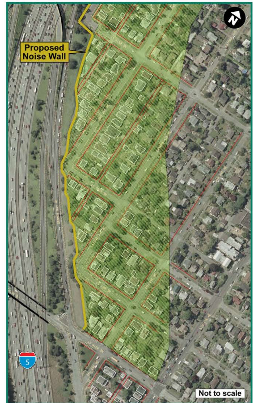
Anticipated noise levels with noise wall