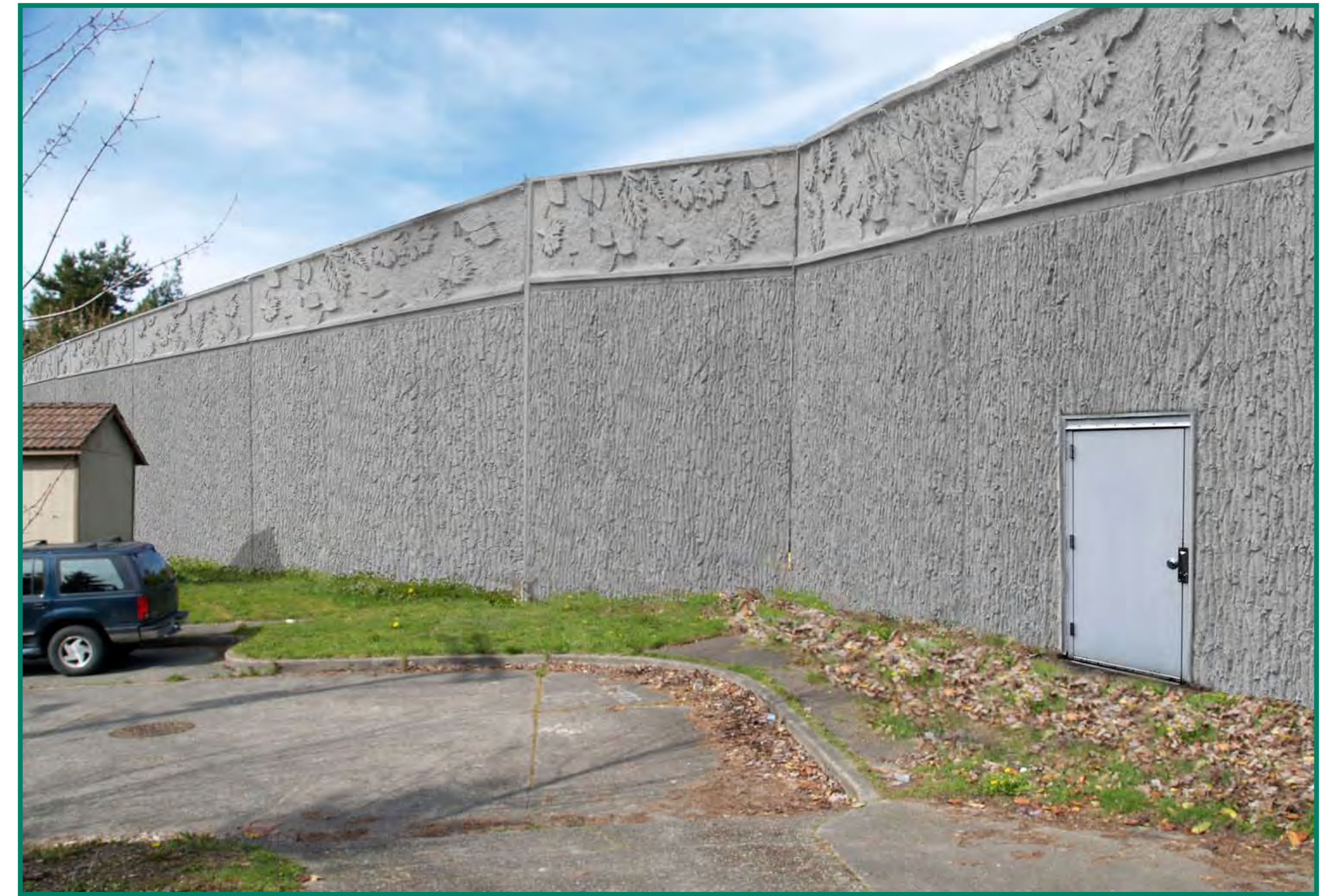
Preliminary conceptual rendering