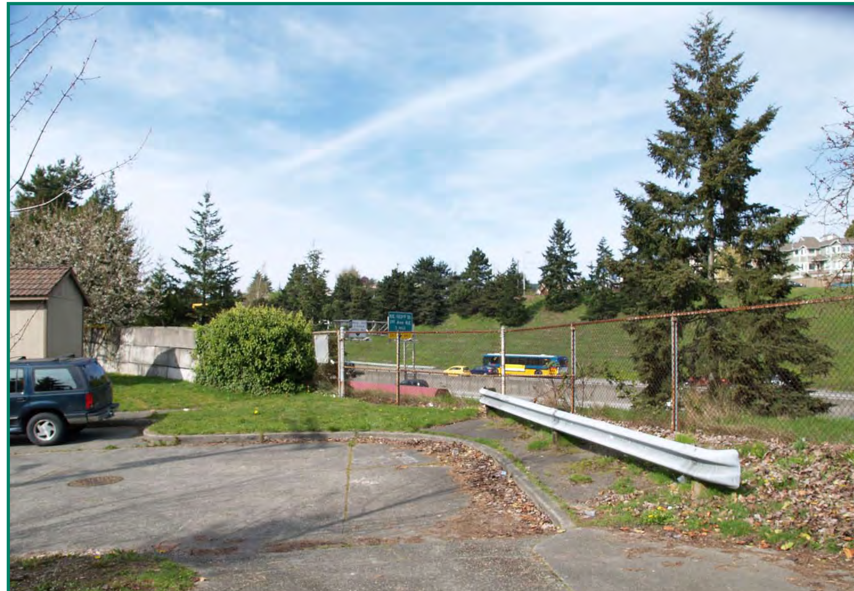
Existing conditions at NE 77th Street looking northeast