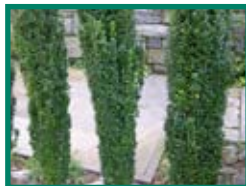
Sky Pencil Holly