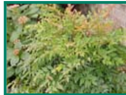
Gulf Stream Nandina