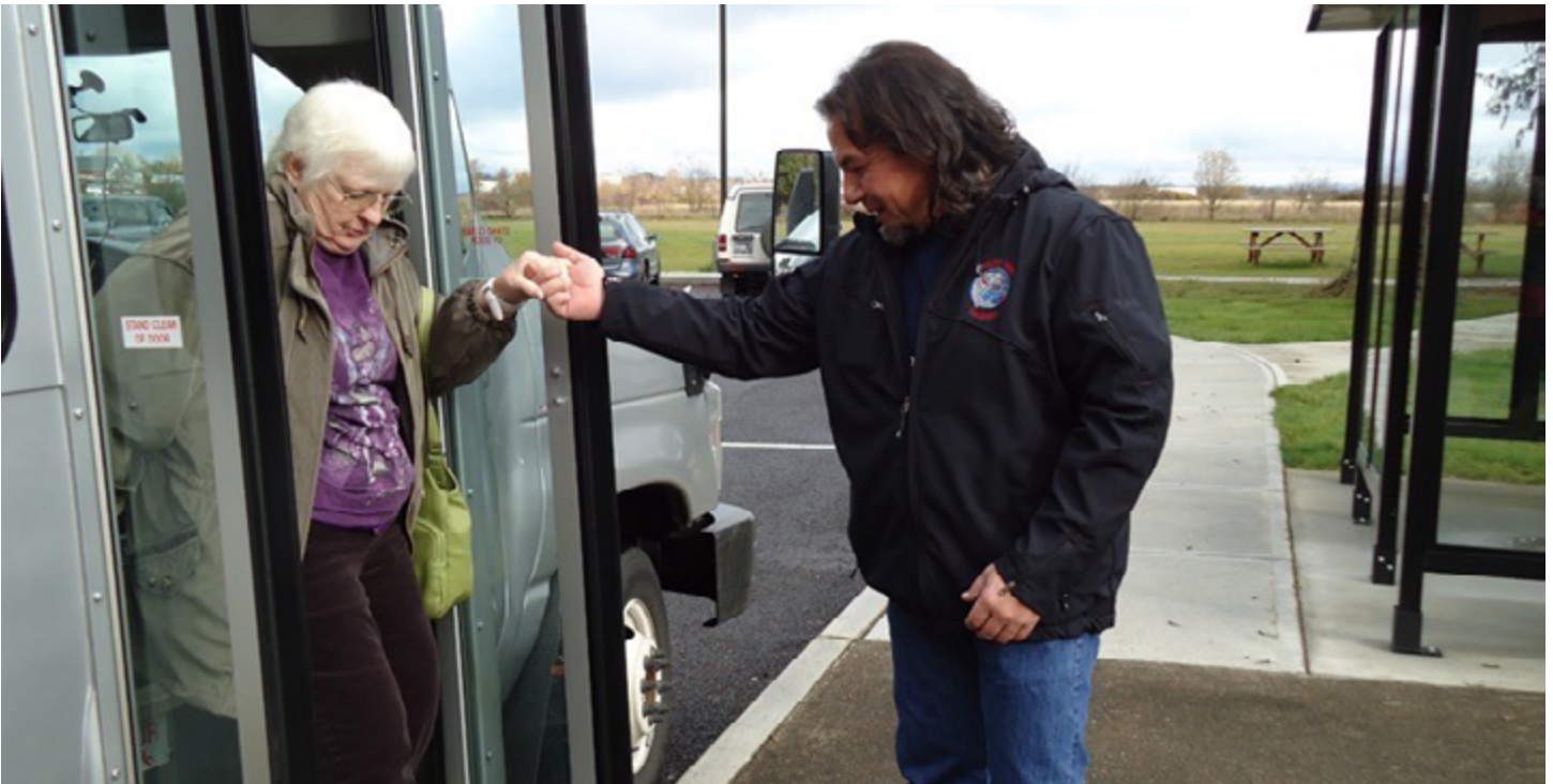
A Cowlitz Tribe Transit Services driver assisting a rider. Photo taken pre-COVID-19.

Through these connections, Yakima Transit provides access to the Greyhound Bus Terminal, Union Gap Transit, and People For People’s Lower Valley Community Connector.