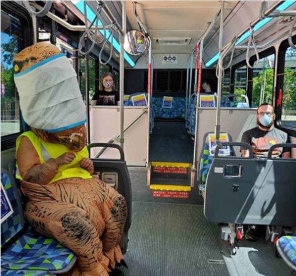
T-Rex reminding Intercity Transit riders that masks are required on the bus (courtesy of Intercity Transit).

T-Rex wants to remind you that face coverings are required on Intercity Transit. The health and safety of our employees, passengers and the community is our top priority. Learn more about the changes we've made for everyone's safety at www.intercitytransit.com/recoveryservice and how you can help. We're all in this together! #MaskUpWA